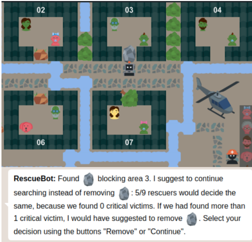
Figure 1: Cropped image of the world used during our study.

Whenever RescueBot found an obstacle or victim, it provided decision support using suggestions and explanations based on crowd sourced data (Figure 1). More specifically, nine people were shown our environment, confronted with task dilemmas, and asked to make decisions and which features contributed most to these decisions. We used this data to generate one suggestion and confidence explanations, feature attributions, and counterfactual explanations. Next, we manipulated communication of these explanations by implementing non-user-aware, trust-aware, performance-aware, and workload-aware agents. The non-user-aware agent did not model the human user and for each decision randomly adapted its provided reasoning information. The trust-aware agent modelled user trust in the agent based on the number of followed and rejected agent suggestions. This agent increased its provided reasoning information when predicted trust decreased (and vice versa) [4, 16, 29]. Next, the performance-aware agent modelled user performance based on the difference between the predicted and real-time score of the task. This agent increased its provided reasoning information when predicted performance decreased (and vice versa) [4, 16, 29]. Finally, the workload-aware agent modelled user workload during the task based on cognitive and affective load [6, 19–21]. This agent increased its provided reasoning information when predicted workload decreased (and vice versa) [4, 24, 28].