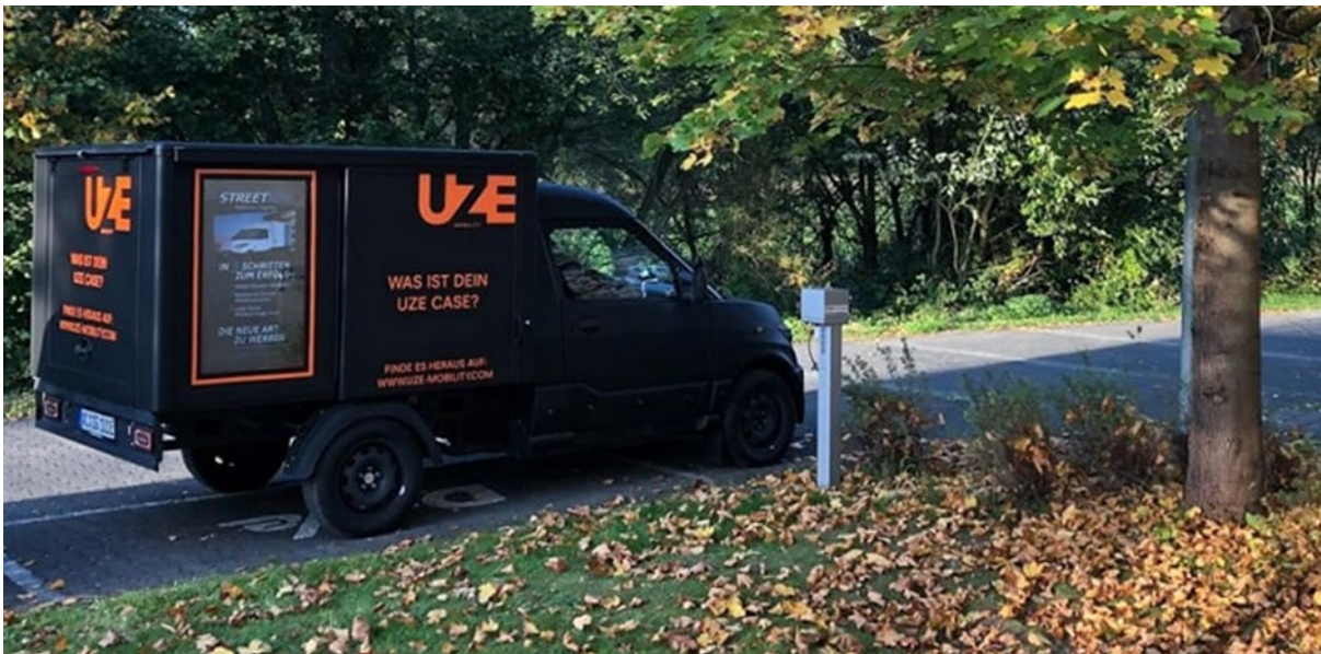
Fig 1. Streetscooter electric delivery van

The best example of a ‘sharing logistics company is found in Germany. UZE Mobility, a new start-up from Aachen in Germany, wants to turn the city into the unofficial e-mobility capital of Germany (Manty, 2018). Unlike other start-ups, UZE Mobility wants to offer their services to users free of charge because they think they have found innovative revenue streams with a different business model.