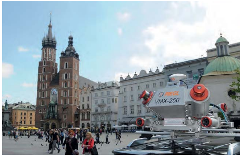
▲ Figure 3: A RIEGL VMX-250 mobile scanning system scanning the historic market square of Krakow, Poland.

losses, injuries and health risks. Renovation of dikes, creation of water overflow areas and protection of vulnerable dunes are essential for urbanised lowlands such as the Mississippi River area and the Rhine/Meuse Delta. For these purposes, detailed and accurate knowledge is required on the variations in elevation of the river bed and the surrounding area, height of dikes, flood waves, along-track and across-track slope of the river and the water resistance associated with land use. The use of a digital elevation model (DEM) or, even better, a 3D map derived from point clouds as input for flood models provides insight into areas at a high risk of inundation. The development of a new urbanised area will affect the flow of water. Is the sewerage system still able to drain off the water after heavy rainfall? Does the rainwater still flow in the direction of