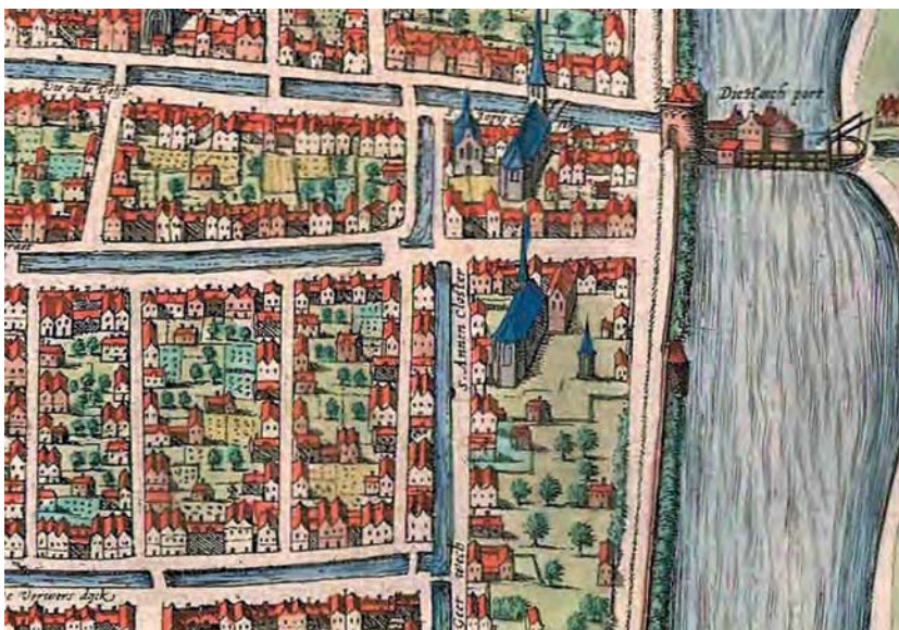
▲ Figure 1: Bird's-eye view of a part of Delft, The Netherlands, drawn in 1580.

megapolis increases traffic, housing, utility density and the risk of calamities, and puts a strain on scarce resources. As a result, the economic, social and environmental impacts are tremendous. Added to this, nearly one billion people live in cities which may be hit by floods, droughts, cyclones, earthquakes or other natural disasters. Humans, power, water, gas, wastewater, bits and bytes – they all are transported through a labyrinth of roads, tunnels, pipes and cables. Flood, fire or other shocks can disrupt these arteries and veins of the city. To cope with these threats and optimise the use of scarce resources, many city authorities want to exploit the opportunities offered by today's technology; they want their city to become 'smart'.