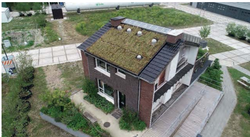
▲ Figure 9: Green village sustainable building on Delft University of Technology campus, imaged from a UAS.

Today's photogrammetric software enables high automation of the chain, from flight planning, self-calibration of consumer-grade cameras and aerotriangulation to the creation of DEMs and orthomosaics as well as their confluence: 3D landscape and city models. However, the creation of detailed 3D maps of cities still requires considerable human intervention. DIM is one of the technological innovations contributing to the automation of the process. DIM is based on semi-global matching, the basics and potentials of which have been developed and demonstrated by Hirschmüller (2008). DIM enables the computation of a height value for each pixel, thus producing high-resolution digital surface models (DSMs) and – by filtering out points reflected on buildings and vegetation – DEMs in (semi-)automatic workflows. To demonstrate the capabilities of DIM implemented in commercial software, the section below presents a project comparing feature-based matching software, developed by students, with commercial software.