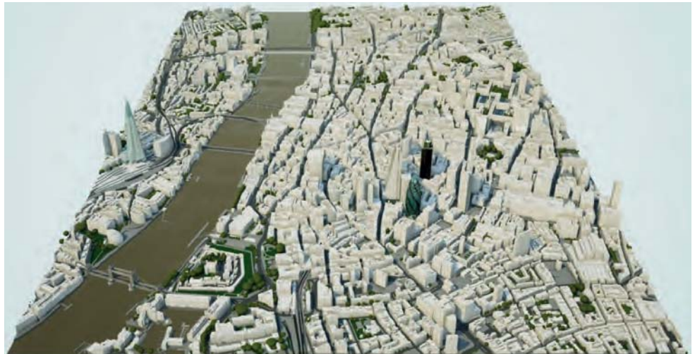
▲ Figure 5: 3D map of a part of London manually created from high-resolution aerial images, covering 6km 2.

The advantages of 3D city maps were first recognised many centuries ago. Armed with only pencil and paper, surveyors and cartographers in the 16 th and 17 th centuries exploited their craftsmanship to produce bird's-eye views which combined a 2D map with perspective views of buildings (Figure 1). Hundreds of years later, aerial images processed with digital photogrammetric workstations enabled extraction of 3D coordinates of corners of buildings and other key points, albeit in a labour intensive process. Apart from various types of imagery (satellite, aerial and terrestrial), today other data sources are available for creating