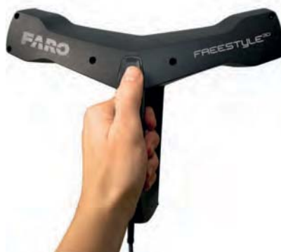
▲ Figure 6: Faro handheld scanner.

research into automated 3D mapping. For example, airborne Lidar enabled Rotterdam to generate a 3D map of buildings which was made openly available in 2011. The basic data source was a detailed map with footprints of buildings. The airborne Lidar point cloud was acquired by Fugro's Fli-Map system in 2010. The accuracy and point density of 30 points/m 2 enabled the