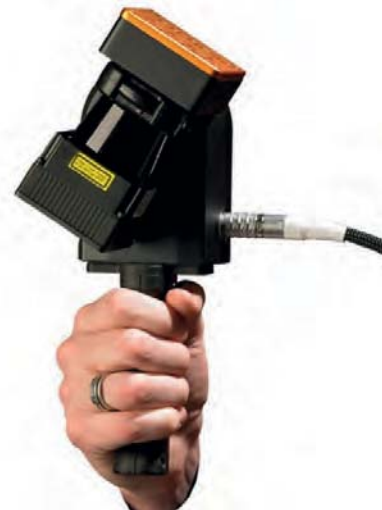
▲ Figure 7: GeoSLAM ZEB-REVO mobile 3D scanner.