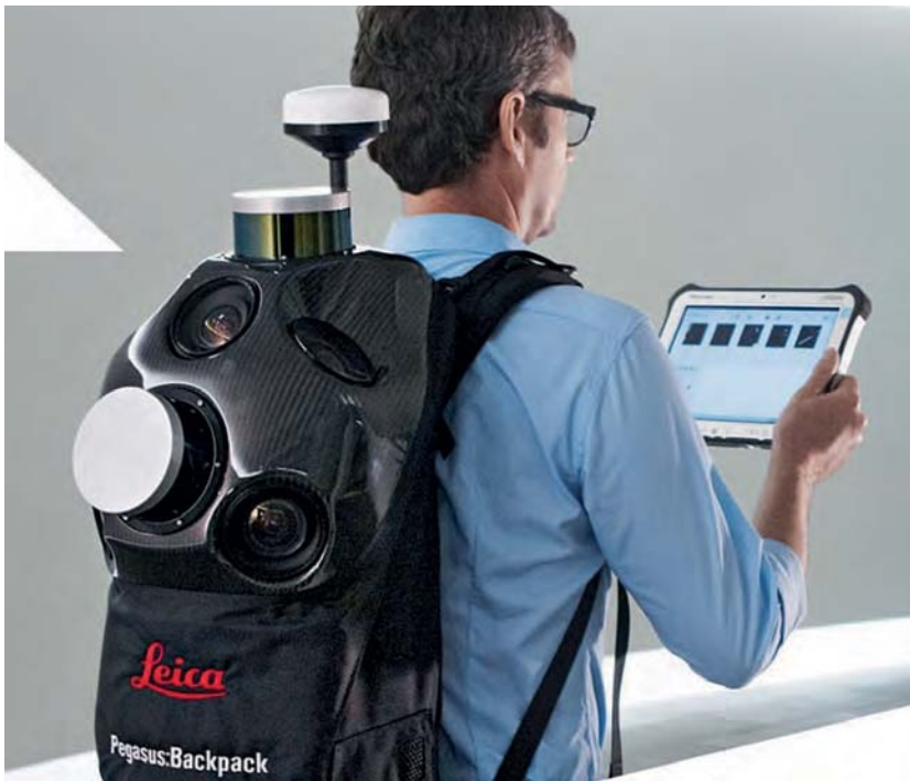
▲ Figure 8: Leica Pegasus:Backpack consisting of five cameras and two laser scanners mounted on a carbon-fibre chassis.

in the SLAM approach. SLAM solutions are also beneficial for 3D mapping of indoor and subsurface spaces using trolleys, hand-held sticks (Figures 6 and 7) or backpacks (Figure 8). On trolleys, the main positioning and orientation sensors are odometers, inertial navigation sensors and lasers. Odometers count wheel spins enabling computation of the speed and distance covered. When mounted on two wheels, odometers indicate directional changes. SLAM does not consist of a particular algorithm, but is rather an approach in which a diversity of solutions are employed depending on on-board sensors, the nature of the environment and possibilities to connect the trajectories with ground control points.