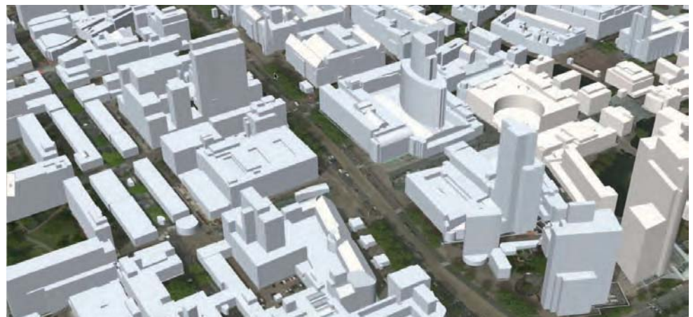
▲ Figure 4: 3D map at LoD1 of a part of Rotterdam automatically created by combining building footprints with airborne Lidar point clouds.

of digital data, which may be collected dynamically or statically, continuously or