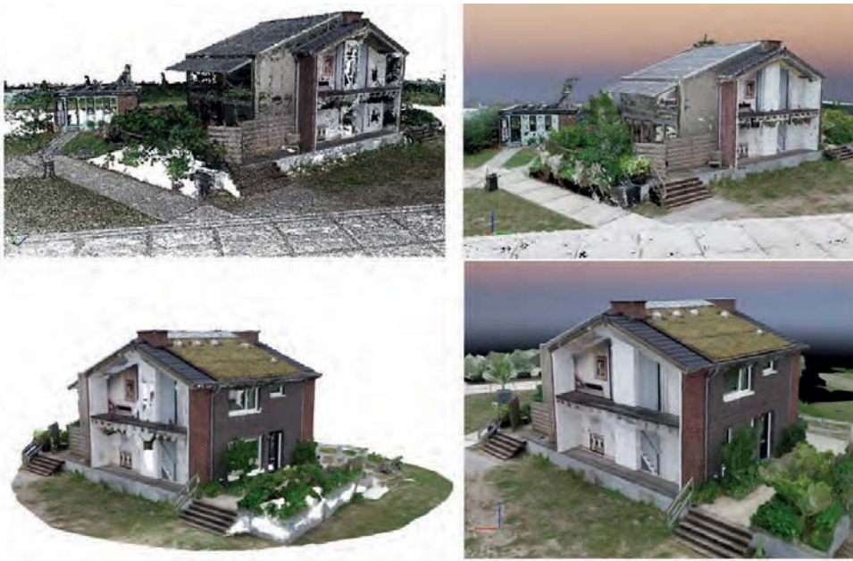
▲ Figure 10: Point clouds and meshes generated by SP software (left) and Pix4Dmapper.

orientations and an initial sparse point cloud using structure from motion (SfM). The