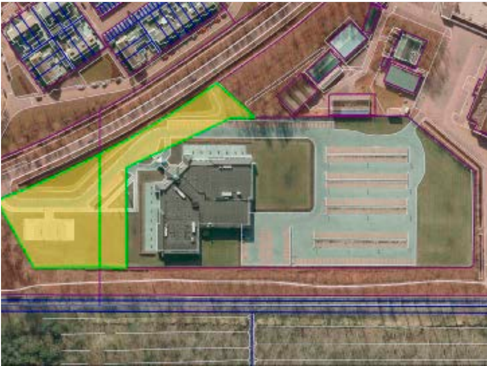
◀ Figure 2, The use of high-resolution imagery will become more and more relevant in relation to land administration.

allowing users to access all information in an unambiguous and understandable manner. Therefore by the year 2025, thanks to these semantic translators, 'outsiders' such as foreigners – and even machines – will be able to understand and rely on the contents of a land administration system just as easily as natives do.