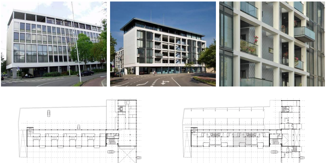
Figure 3: Granida. Left: the building before conversion; right: the building after conversion. The location near the city centre and the image of the building were important success-factors for this conversion. Alterations of the façade and a bad technical state of the structure led to high construction costs.

Most of the revealed risks were technical. Several influence the financial feasibility. A lowered ceiling and floating floor were placed; constructions were repaired, shafts cut through reinforced concrete floors and legal procedures were fought, before permits were obtained. But the conversion costs rose as a result. Developers who were interviewed complained about overrun budgets and too many hours spent to develop specific solutions to problems that occurred during the construction. Still, the projects were financially feasible. Table 3 summarises the most striking risks found in the Dutch cases.