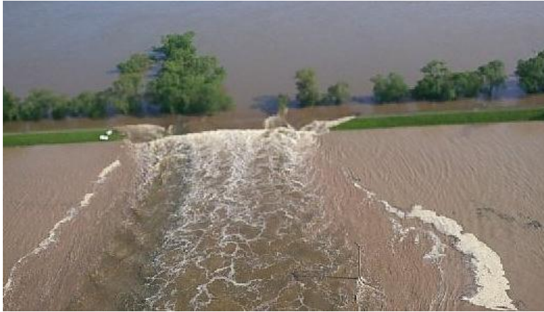
Figure 1. Breach in a river dike as a consequence of inner slope sliding at Breitenhagen, Germany, during the Elbe floods in June 2013

Observed survival of water level w_{obs} . In this paper we focus on the instability of the inner slope of (river) dikes as failure mechanism, as can be seen in Figure 1