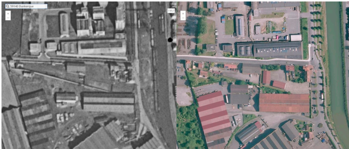
Figure 4. Comparative aerial picture of the second site Marchand in 1957 on the left, and in 2015 on the right. Picture of the service “remonter le temps” from the French National Institute of Geographic and forest information, or IGN.

Figure 3. Aerial picture of Dunkirk in 1947, with the alleged second site of Marchand. The railway is visible within the site and leaves on its east part, towards the canal Bourbourg, as explained in the article of Thelliez. Picture of the service “remonter le temps” from the French National Institute of Geographic and forest information, or IGN.