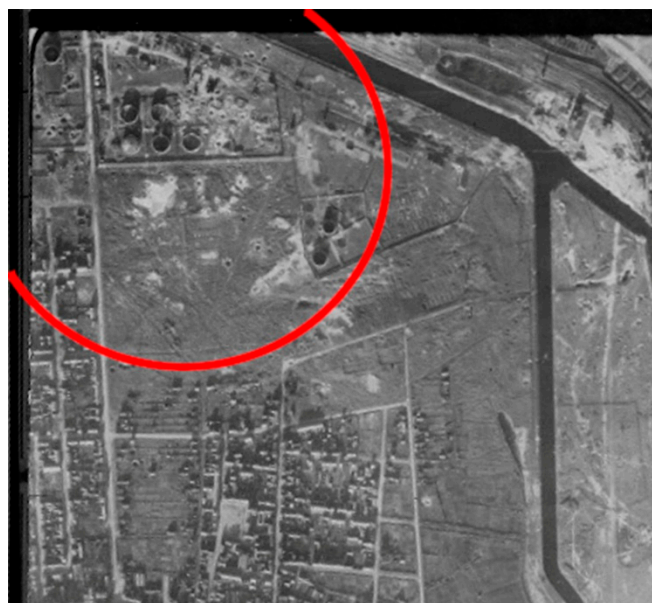
Figure 1. Aerial picture of Dunkirk in 1944 with the destroyed oil storages. The concentration of impact around the site reveals its strategic nature.

The Second World War, which destroyed three quarters of Dunkirk, had an influence on the petroleum pollution in the city. Considering how strategic this resource was during the war, both forces destroyed storages and refineries along with the rest of the city (Figure 1). The petroleum that these facilities contained ended up polluting the soil of the port city. The post-war reconstruction of petroleum facilities on the same sites prevented any cleaning process; there was a need for inhabitants and public authorities to fasten the renewal of the port and an absence of environmental considerations before the 1970s.