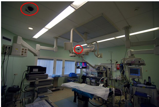
Fig. 1 Conventional cart-based OR (dome cameras are circled)

Patient and procedure characteristics were derived by chart review. For statistical analysis, The Observer ® XT 11.5 software and SPSS 20.0 statistical software (Chicago, IL, USA) were used. A Pearson Chi-square test was used to compare proportions, and a Student's t test was used for continuous variables. To describe non-normally distributed data (kurtosis between -1 and +2 ) or in case Levene's test showed no homogeneity of variance, the median and interquartile range (IQR, 25th and 75th percentiles) were used and a Mann-Whitney test was performed. A p < .05 was considered statistically significant.