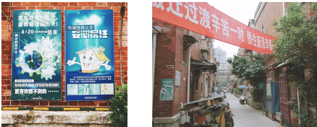
Figure 3: Author. One of the billboard on the photo on the left is about the warning on rejection of temporary relocation, while content of the other is about renovation details to avoid moisture inside houses; photo on the right is the encouragement and for a brighter future of better living conditions. [Shanghai, 2017]

In American sociologist Harvey Molotch's urban theory, a city, or any place, is the representation of interests of elites, which is also very much in line with Henri Lefebvre's discussion on space production 26 . In such competition between varied elites, by utilizing local government and authorities, both sides strive to induce investment growth in their own fields, sacrificing profit of the other stakeholders. Nevertheless, in Chunyangli housing renovation project, with increasing investment from local government, relationship between elites and other stakeholders seems to be becoming simple and pure. However, considering the core principle of social justice, this paper questions where should funding supply from if local government dominates and takes the most responsibility within urban heritage transformation? If most of these funds are borne by the government and