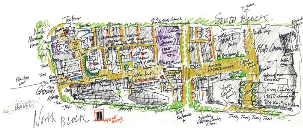
Figure 2. WOOD & ZAPATA. Sketch manuscript of Wood's urban design in Taipingqiao area, and in this redeveloping process, residents could not be involved. [Shanghai, 2017]

Xintiandi project is a commercial redevelopment conducted by Hong Kong developer Shui On Group in 1997. Designed by American architects Wood and Zapata, two city blocks in the former Taipingqiao area has become the most popular and luxury shopping and entertainment hubs in Shanghai (Figure 2). Standing for "new world" in Chinese, stakeholders introduced a new lifestyle into this renamed Xintiandi project 20 . Before Xintiandi redevelopment, there were 23 vernacular old neighbourhoods in Taipingqiao area, accompanied with seventy thousand people. Located within the conservation area of the First Communist Congress historic site, this redevelopment project should comply with certain laws and regulations of cultural relics protection. Since the limitation of targeted regulations, guidelines, orders and recommendations from local authority, seizing maximization of interests has become the major subject throughout this specific "developmental-conservation" project 21 .