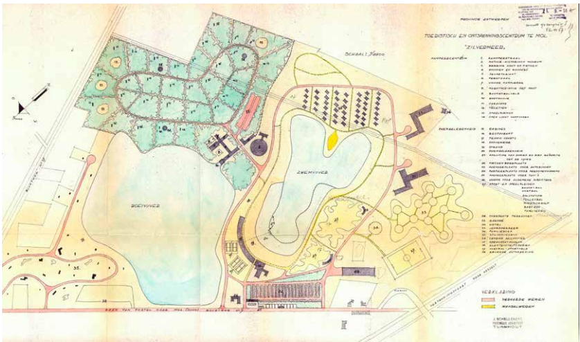
Figure 01: Original plan of the provincial recreational domain Zilvermeer, designed by architect Jozef Schellekens in 1956.