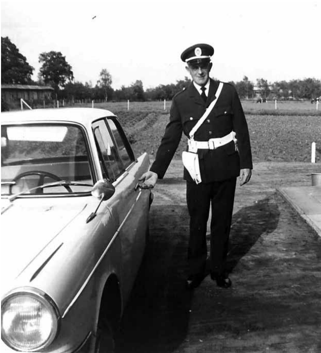
Figure 11: Zilvermeer guard, date unknown.

translation of More's idea(l)s. The utopian world that is evoked within the boundaries of the holiday camp is specifically designed to offer its vacationers an escape from outside reality. Post-war Belgian holiday camps staged a "blissful" atmosphere. They not only provided the necessary scenography and props, but also the essential regular "cast": the personnel. For instance, the head of Zilvermeer obtained the title "director" ( regisseur ), 57 a term directly borrowed from the theatre jargon and a straightforward reference to the holiday camp as a stage upon which leisure life was enacted. Many holiday camps also had guards – a "bright and breezy" alternative to armed forces. At Zilvermeer , these guards wore green uniforms, equipped with shiny white handgun holsters, which were always empty since they were not allowed to carry firearms. This "costume" gave them the appearance of – as one interviewee noted – a hybrid between a police officer and a scouts leader; 58 an association that eloquently mirrors their function. They were the prompters (or souffleurs ) of the holiday camp, who ensured that no one participating in the play fell out of character and that the show was not disrupted.