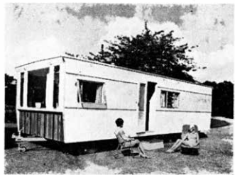
● La majorité des emplacements de camping est occupée en Belgique par des caravanes sans roues. Leurs propriétaires les ont transformées en petites maisons.

Figure 13: Newspaper article: "At the camping plot that one rents for a year, the nomad's shelter has become a second home that the men repaint and the women clean".