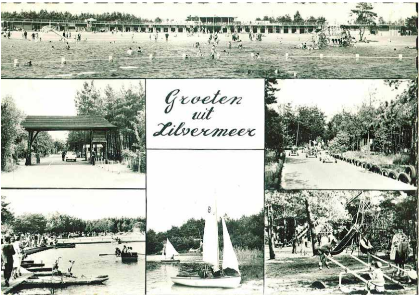
Figure 05: Zilvermeer postcard, date unknown.

Both camps also had their own emblems. That of Zilvermeer, for instance, depicted a fish and a conifer cone in front of an ocean blue background. It clearly referenced the natural assets of the holiday camp, which was built around two large water pits amid a pine forest. This emblem was displayed at different locations inside the camp’s territory. There were two at the entrance gate, one on each side, 44 which explicitly marked the passage into a leisurely “land” of heavenly blue waters and tall pine trees. Furthermore, it was prominently depicted on the camp’s early postcards, accompanied by the slogan: “Greetings from Zilvermeer”. These postcards mimicked holiday postcards that people would send from a sunny, foreign location: “Greetings from the Spanish Riviera”. They not only reinforced the illusion that holidaymakers at these camps were on holiday abroad, but they also contributed to the perception of the camp as an autonomous entity. Building further on this reference, these postcards boasted the holiday camp’s most important attributes as if they were unique points of interest, designed for photo-ops.