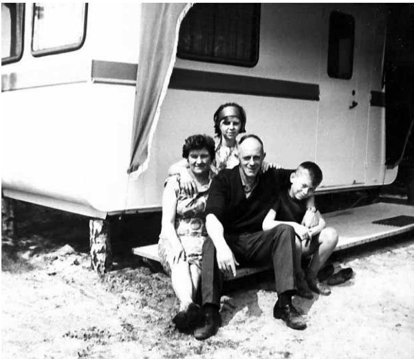
Figure 15: The “nuclear” family on vacation at Zilvermeer, date unknown.

This gendered behaviour at the camping ground was confirmed by all other interviews in which both husband and wife participated. 72 It clearly illustrates the enactment of the middle-class ideal of “his work, her house”, in which the husband is the sole financial provider for the family and the wife tends to the house and children. Images of the nuclear family on holiday were incessantly woven with the quotidian and the corresponding gender patterns of this middle-class family ideal were repeatedly affirmed in commercial advertisements, popular media and holiday brochures distributed by social organisations.