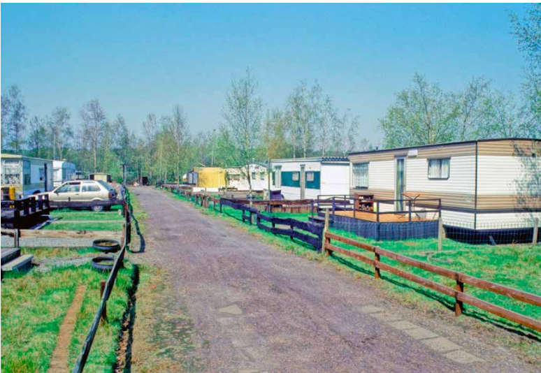
Figure 12: Simulated “suburban street” at Zilvermeer. Each (individual) plot is clearly delineated by a picket fence and all plots have their own driveway, approximate date: late 1980s.

Following an inspection of the camping ground, we have noticed that many trailers are in severe violation of camping ground regulations: [...] Any form of fencing or planting is strictly prohibited. All fixed constructions, additions, lean-tos, shacks, windscreens, walls, concrete tiles, masonry in cement, plaster or any other material, poles, and so on – in short, all materials that do not belong on the camping ground – should be removed. 68