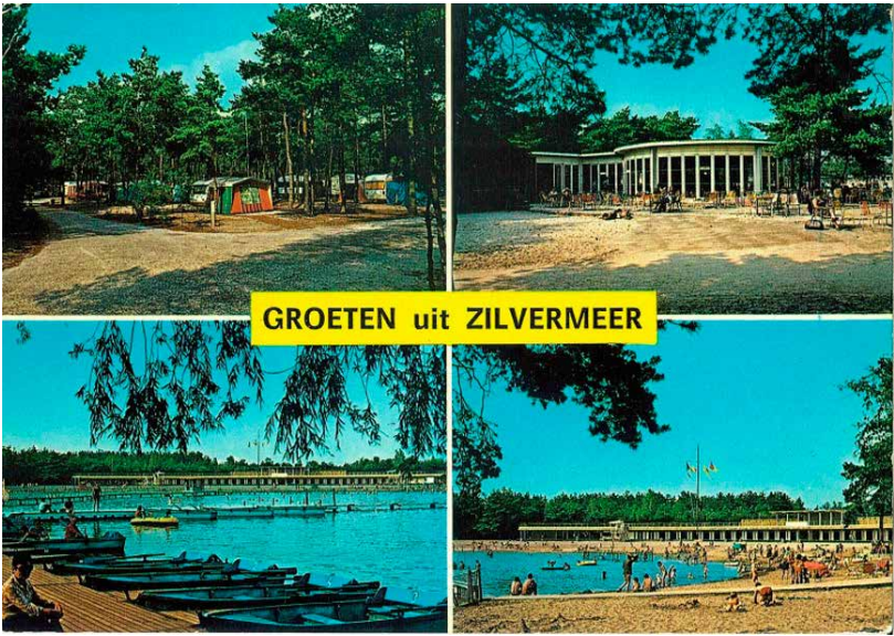
Figure 06: Zilvermeer postcard, date unknown.