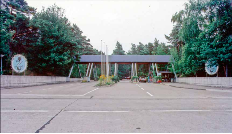
Figure 04: New entrance gate to Zilvermeer, date unknown.

travelling abroad for working-class people; a luxury most of them could – in this period – not (yet) afford.