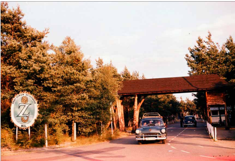
Figure 03: Entrance gate to Zilvermeer, approximate date: early 1960s.

This citation exemplifies, besides the importance of the physical boundary surrounding the holiday camp, the significance of a pronounced threshold that emphasises the entrance. In most camps, this “task” was fulfilled by a gate, which became an important feature in the act of going on vacation: “As soon as we drove past that gate, the world outside did not exist anymore. We were elsewhere.” 40 Decorated with flags, guarded by a sentinel and accompanied by signage that alluded to the crossing of a boundary, the physical appearance of these gates echoed that of former road-check posts at (European) country borders, which were still operational at this time. The gates became “architectural” signposts, which simulated the experience of