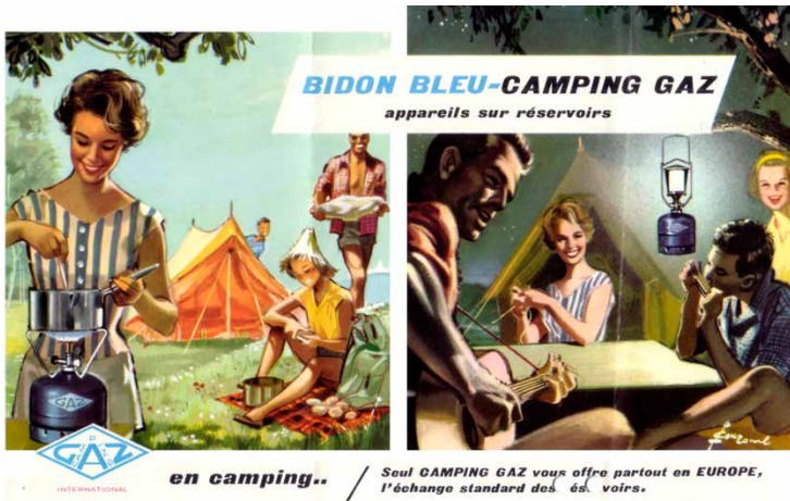
Figure 16: Advertisement for the Bidon Bleu – Camping Gaz, clearly depicting distinct gender roles on the campsite.