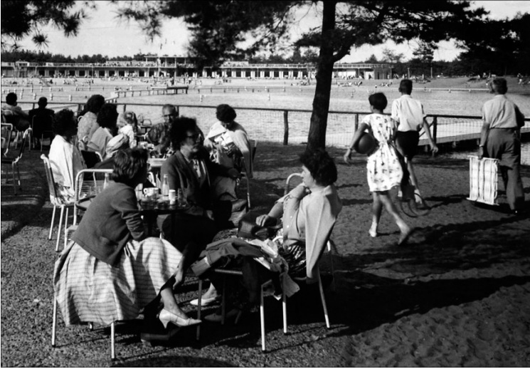
Figure 10: Women in fancy dress at Zilvermeer, date unknown.

their holiday place as a “home away from home”: Returning each and every weekend, furnishing the place with beautiful things, decorating it, making it more and more comfortable, were activities shared by many habitués of the camps. 53