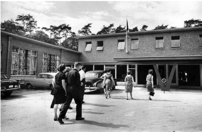
Figure 08: Entrance to the main building in Hengelhoeft. (source: KADOC, Leuven – collection: Vakantiegenoegens).

A similar story is told by the holidaymakers of Zilvermeer , where campers could attend mass in a “chapel”: “My nephew played the organ and we had a choir, which practiced in the chapel. It was a kind of concrete shack [...] which was quite large. Every Sunday morning, around 10 am, it was packed with people.” 47 Belgian holiday camps thus not only possessed most of the facilities that contemporary small villages had but – in spite of