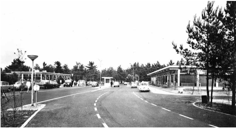
Figure 07: 'Urban' street at Zilvermeer, approximate date: early 1960s. (source: Provinciaal Domein Zilvermeer, Mol).