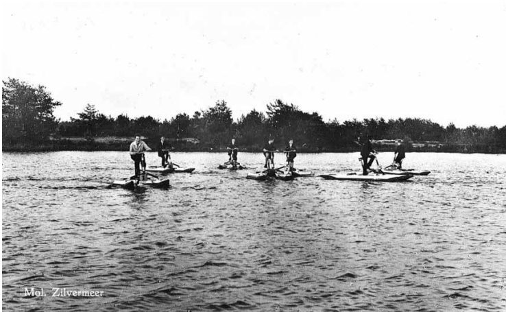
Figure 09: Zilvermeer postcard, depicting men in costume on water-bicycles, date unknown