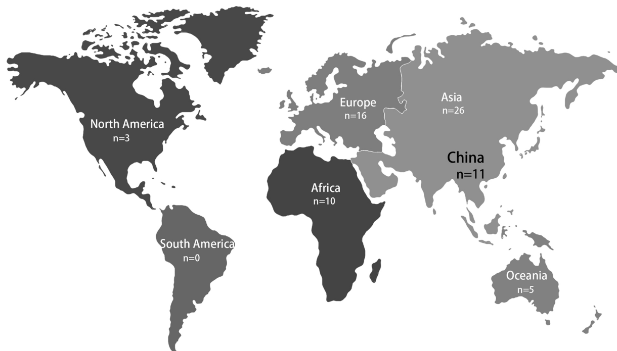
Fig. 1. Geographical distribution of the case studies by continents.

Furthermore, the participation of Chinese businesses reaches almost half of the cases (43 percent), compared to the international cases (18 percent). Businesses play an important role in the profit-driven processes of decision-making in China, which is in line with the government's expectations.