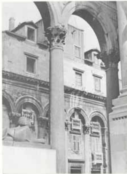
Spread from Forum , no. 2, 1962, special issue on Split, sketches and photos by Jaap Bakema

9 For more on the history of Forum : Francis Strauven, The Shape of Relativity , Amsterdam: Architectura & Natura, 1998, chapter 8 'Forum 1959-63'.