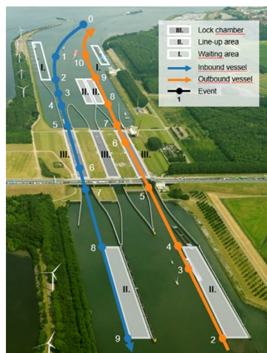
Figure 1 The Volkerak lock complex with highlighted infrastructural elements that are critical for modelling the vessel behaviour (logistics) during lock passages. Critical elements and events are numbered (image by F.P. Bakker & M. van Koningsveld, is licenced under CC BY-SA 4.0, the background image was retrieved from https://beeldbank.rws.nl , Rijkswaterstaat).

With increasing traffic and growing vessel sizes, deeper waterways, larger navigational locks and