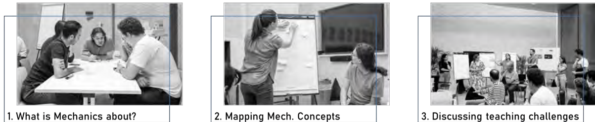
Figure 4 Hands-on activities of the mechanics teachers social lunch event

In June 2022, PRIMECH launched the Mechanics Teachers Social Club by organising the first networking event, a social lunch where all TU Delft mechanics teachers were invited, with the aim of convincing them to join the CoP. Strategic partners were also invited to inform them of PRIMECH's results up to this point and collect their feedback. Around 25 people participated in the event. Through the three hands-on activities displayed in Figure 4, attendees had the opportunity to get to know each other, discuss mechanics education in TU Delft Bachelor programmes and the challenges faced in teaching this subject.