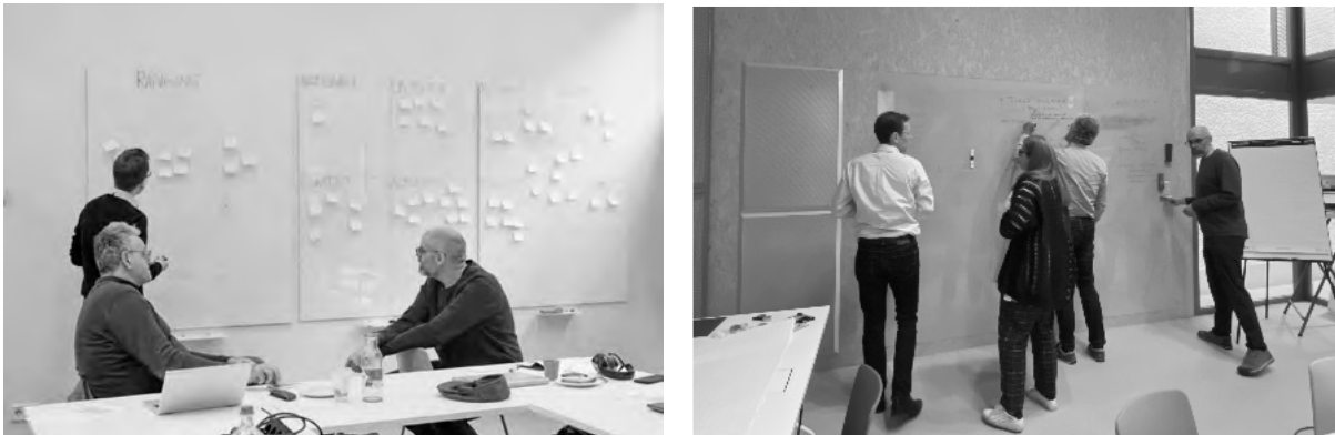
Figure 2 – Statics teachers during two of the PRIMECH workshops

After defining the project objectives, a co-design process was initiated to delineate the intervention strategy. Three statics teachers from different faculties (Mechanical and Maritime Engineering, Aerospace Engineering, and Civil Engineering) were selected to participate in the co-design process. This is as statics is taught similarly in the first quarter of the first-year bachelor programme in these faculties and served as the students' initial exposure to engineering after high school. Five workshops were conducted over five months to explore the solution boundaries further. Figure 2 showcases the statics teachers during two of the workshops.