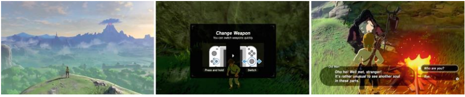
Fig. 1. In Zelda: BotW [32] the player's attention frequently shifts between, e.g., affective (a beautiful vista), gameplay (learning controls), and social (meeting an NPC).

energy in. Mechanics that are deep enough, however, can maintain attention for a long time. Narratives and characters neither capture nor hold attention very well; while people are drawn to them, it is challenging to write them in a way that are both quickly understood and remain interesting [1]. Finally, elements aiming at affective involvement capture attention well (e.g., through art style, music, and sound design), but are less likely to hold attention unless the game offers other elements of substance.