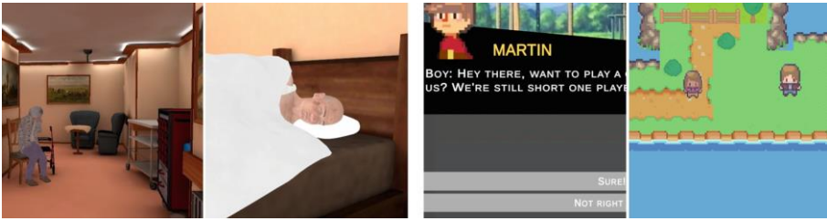
Fig. 2. Screenshots from the case study prototypes of PCC (left) and WLGYL (right).

about emotions and social skills. The game was designed with input from psychologists and the target audience in multiple co-design sessions. In the game, the player takes the role of a young girl going on a summer camp, where her task is to make new friends. She does so by exploring the camp and talking to other characters. Talking to characters presents the player with narrative scenarios, in which a player needs to make choices. The scenarios encourage the player to explore the effects of choices to learn about different types of social interaction. Each interaction is rewarded with an ‘emotion card’ (e.g., ‘anger’) that provides information on that emotion.