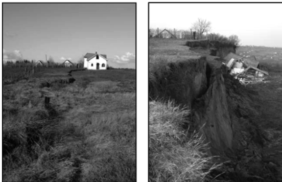
Fig. 88.1 Beginning of landslide in 2007 (left), and landslide after February 12, 2008 (right)

An example highlighted in the following is a new deformation analysis system based on AI techniques. Here AI shall be used for the task of deformation assessment and deformation interpretation. The main task of the AI component is to transfer the information of a deformation analysis in a useable form for an automatic deformation interpretation. Therefore different approaches from the AI field are used and joined to a case-based reasoning system. The simplified measurement and analysis procedure, including the deformation assessment component is shown in Fig. 88.2. Although this deformation assessment is mainly developed for a terrestrial laser scanner and image-based measurement system, an extension to other data acquisition systems is possible. The deformation assessment developed at the Vienna University of Technology is based on the idea of supporting the expert who performs the interpretation by former