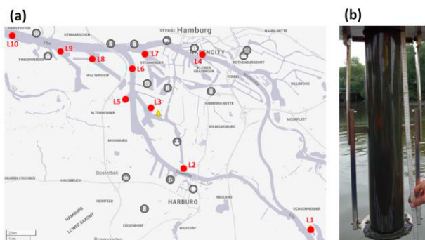
Figure 1: (a) Selected locations in the Port of Hamburg, Germany for collecting mud samples, (b) sample collector (Frahmplot).

Natural mud samples were collected from different locations (Figure 1a) and depths of Port of Hamburg, Germany using 1 m core sampler (Figure 1b). The obtained samples were then subsampled into different layers on the basis of their consolidation stage. The bulk density of the mud samples was estimated by the oven drying method. The organic matter content (TOC) of mud samples was determined using an ISO standard 10694:1996–08. The Thermo Scientific HAAKE MARS I rheometer with concentric cylinder geometry was used to perform the rheological measurements. Stress ramp-up test, at a sweep rate of 1 Pa/s, was carried out to analyse the yield stress of mud samples.