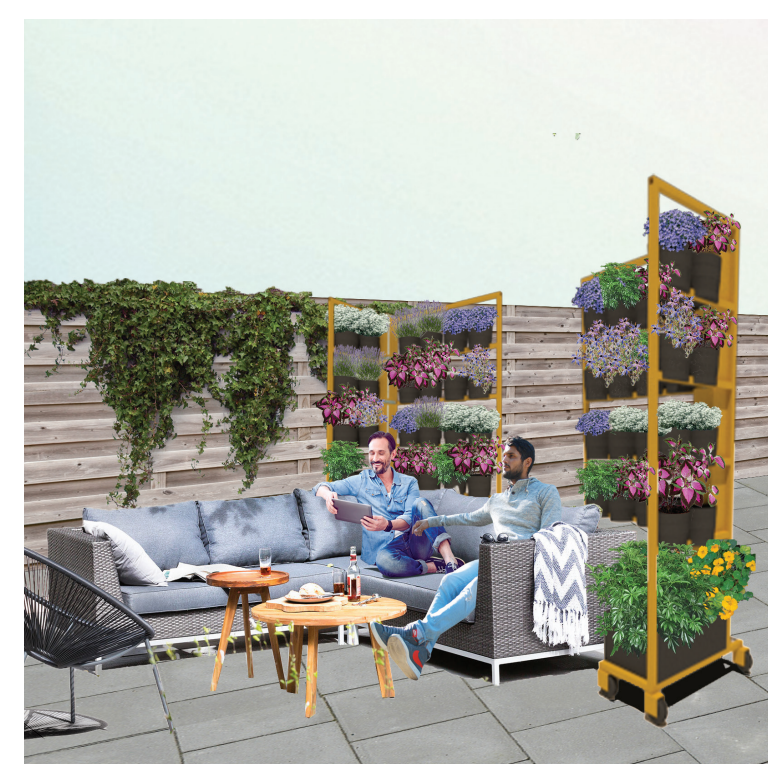
Creating different areas in the garden.