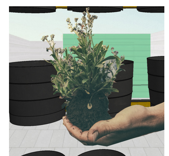
3 | Adding the plants.