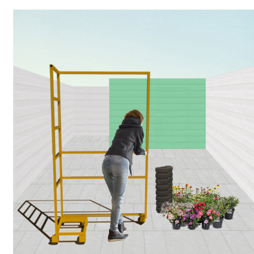
2 | Assembling the Daeza.