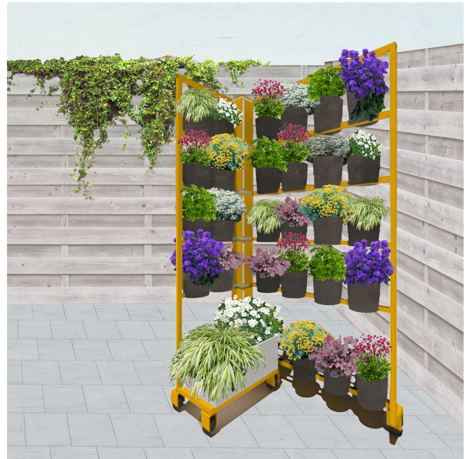
The Daeza in a paved garden.

The Daeza stands out in the paved garden by offering a large and clearly demarcated surface, which is filled with plants. The vertical direction contributes to the composition of the garden. The visual impact of the Daeza encourages interaction between the user and flora and fauna.