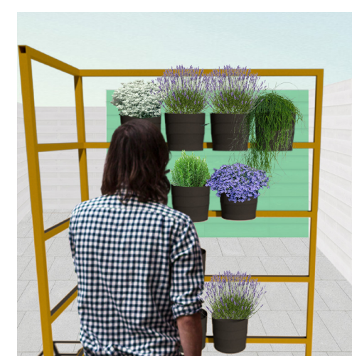
4 | Making a composition.