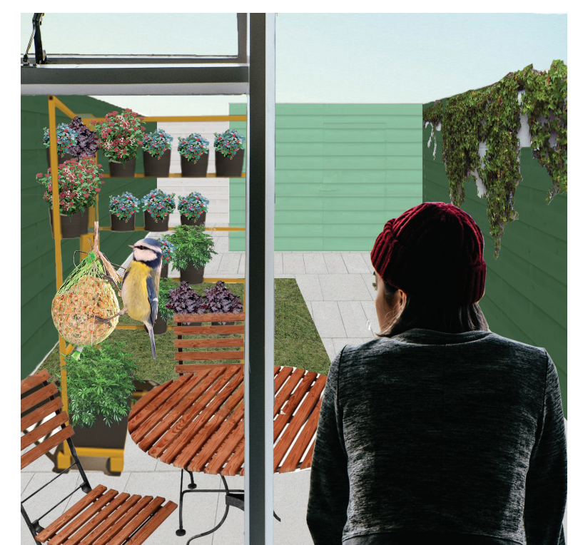
The Daeza as winter scenery.