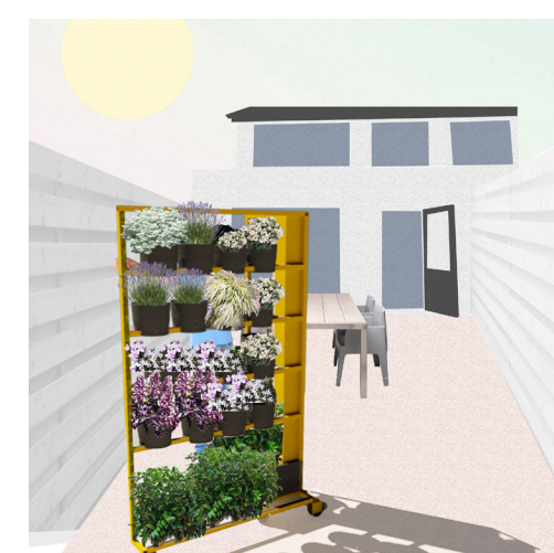
5 | Positioning the Daeza.