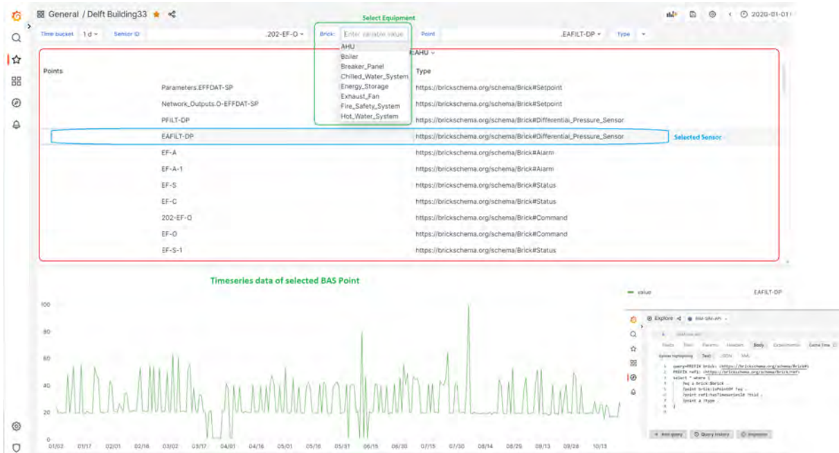
Figure 3 Visualizing time series data using Grafana web application using the metadata schema.