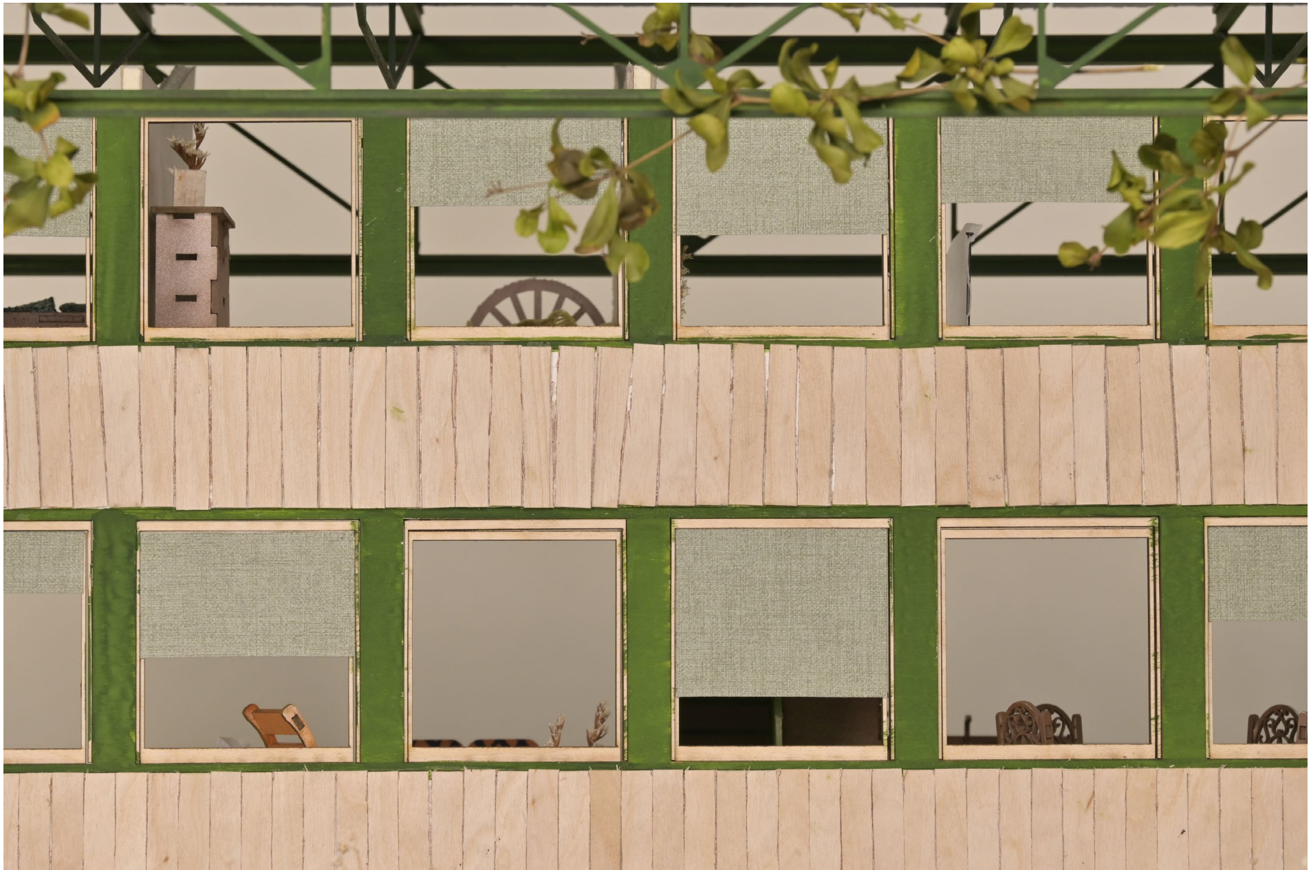
photographs of final model (1:20) - transformation & reuse