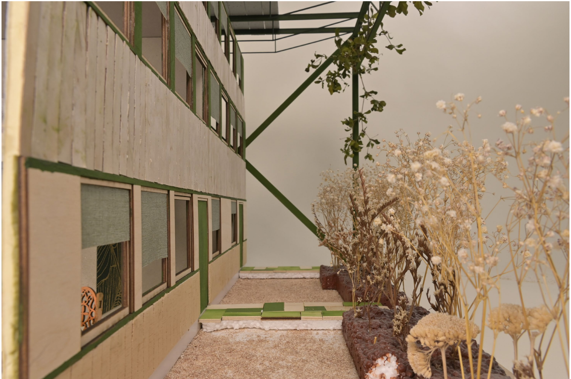
photographs of final model (1:20) - transformation & reuse: semi-private front garden