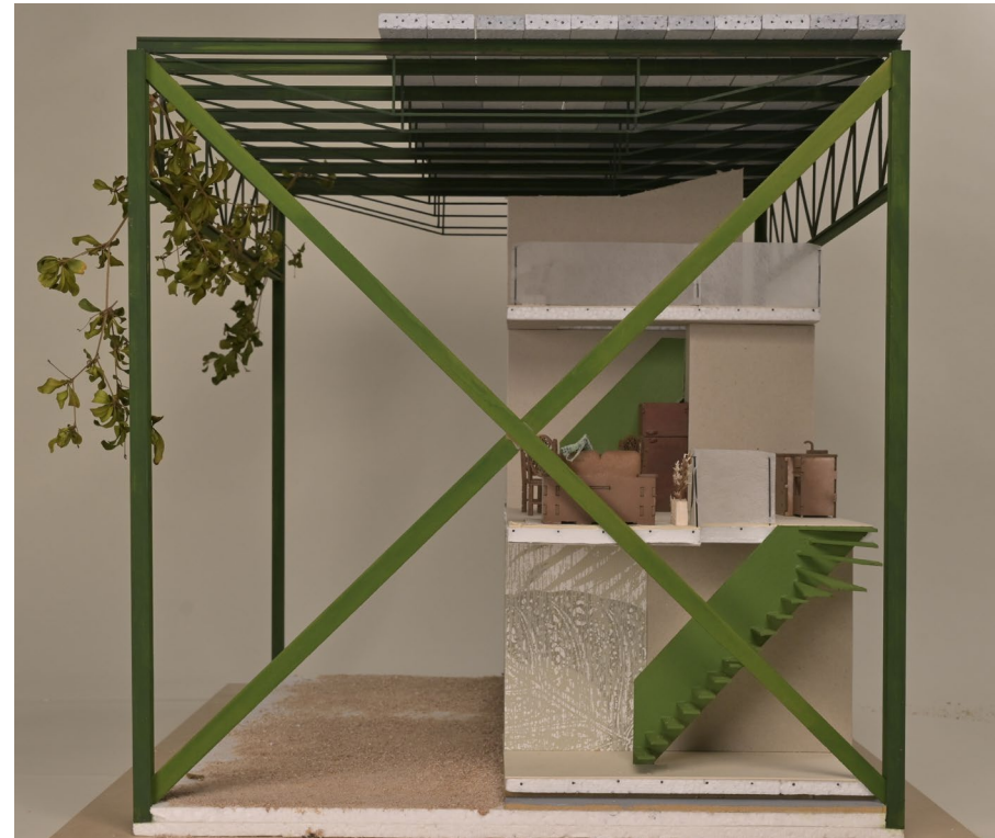
photographs of final model (1:20) - transformation & reuse