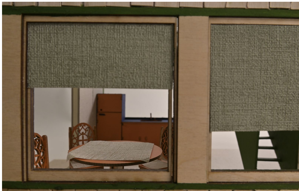
photographs of final model (1:20) - transformation & reuse: details of living