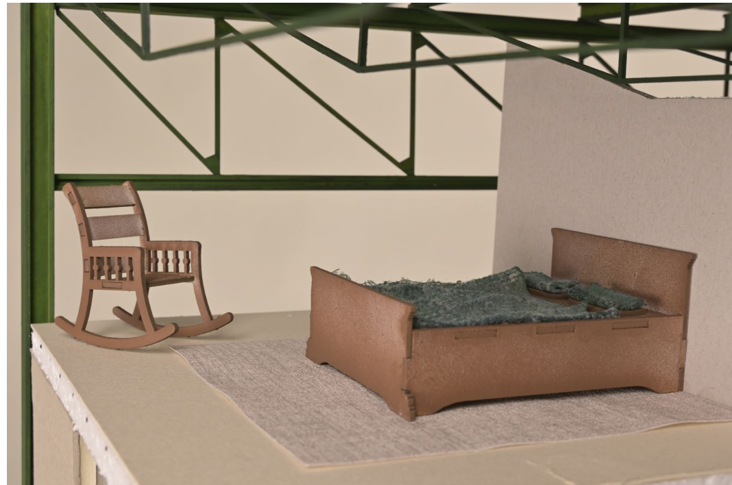
photographs of final model (1:20) - transformation & reuse: a family unit