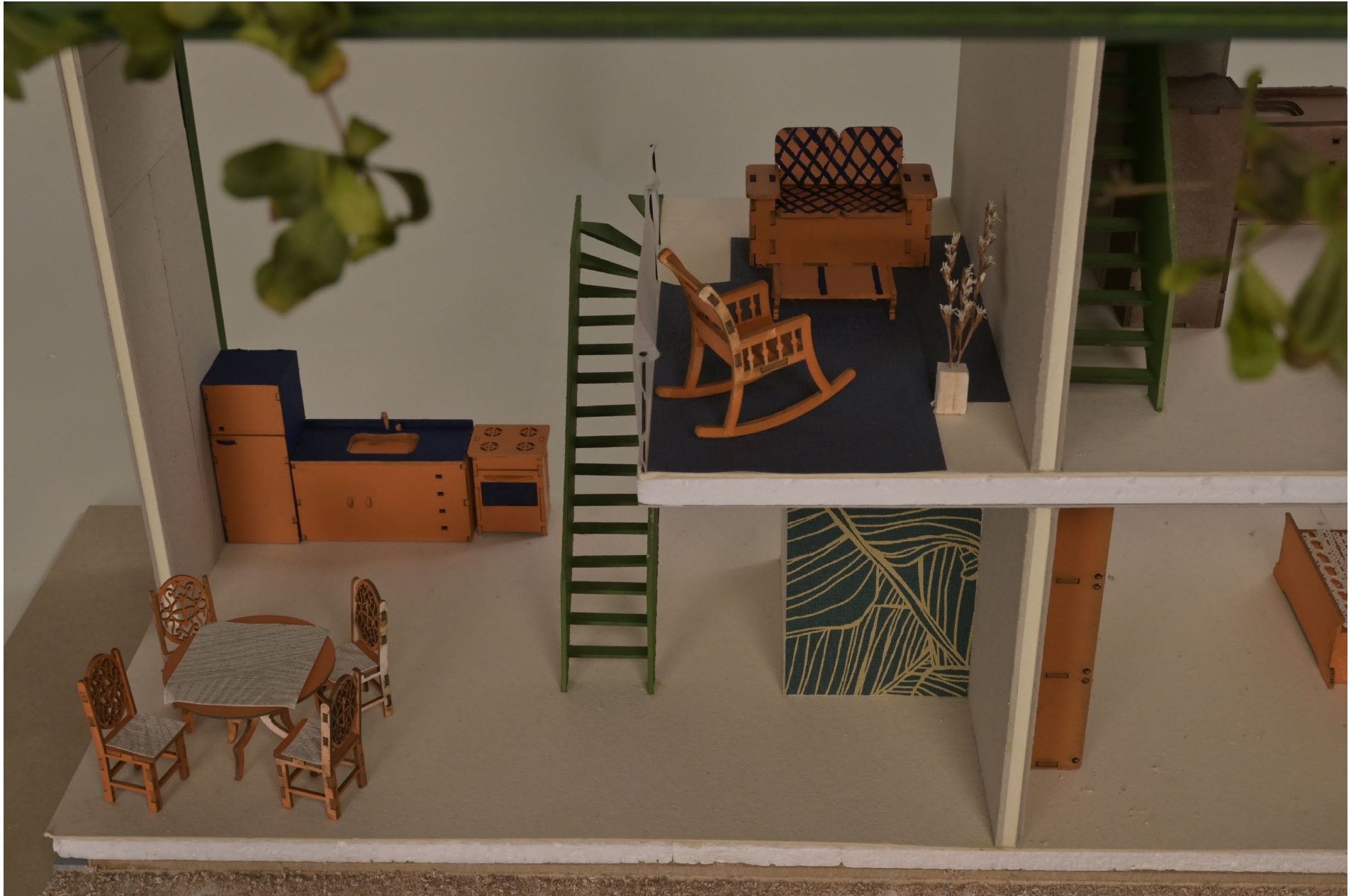
photographs of final model (1:20) - transformation & reuse: an artist's residence