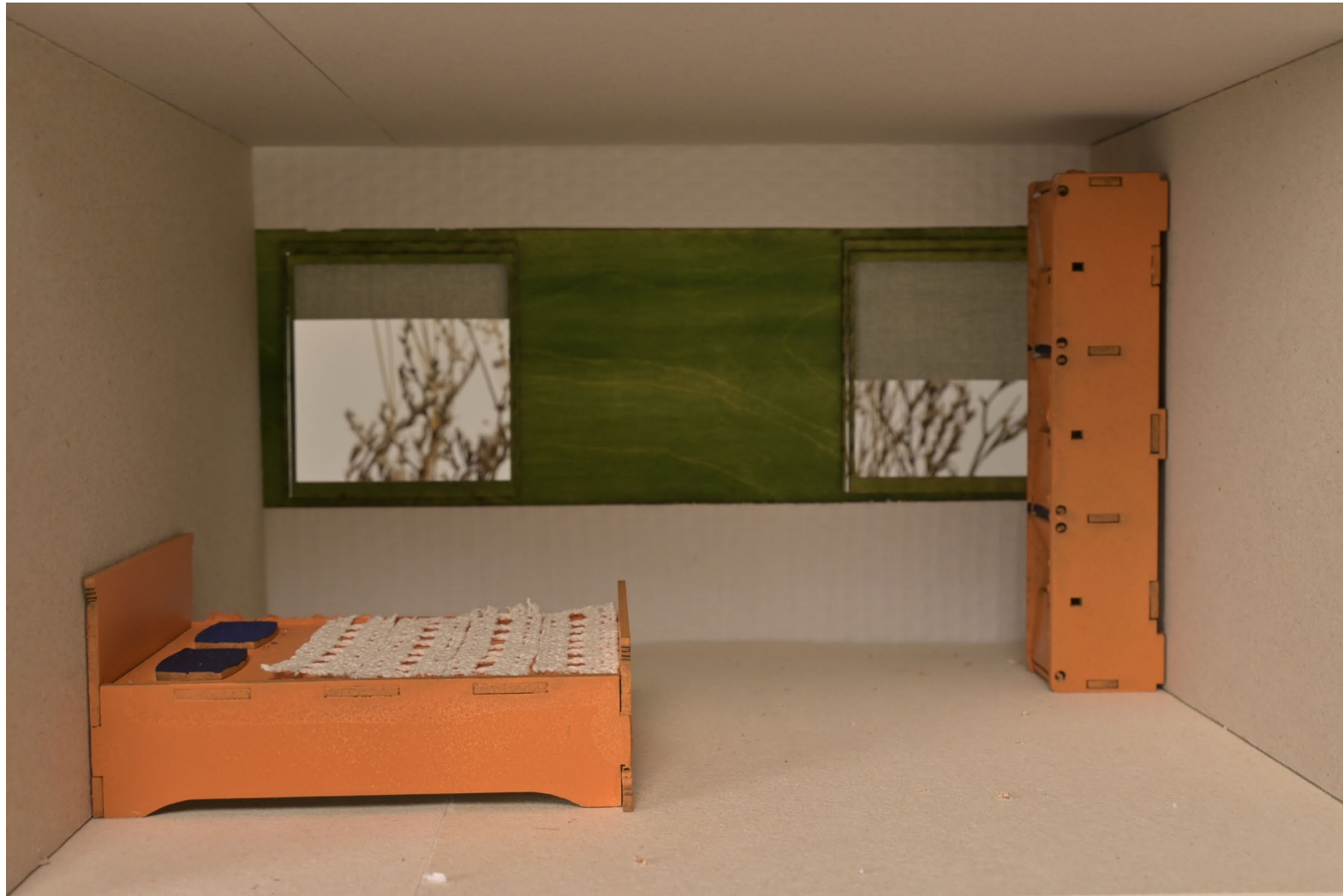
photographs of final model (1:20) - transformation & reuse: an artist's residence