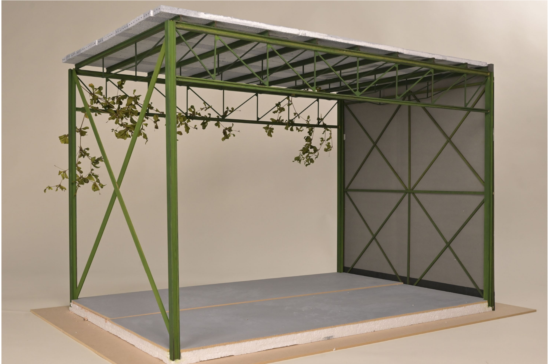
photographs of final model (1:20) - dismantle phase: the structure stays in place