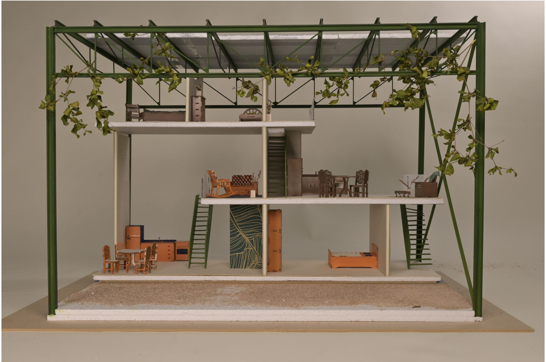
photographs of final model (1:20) - transformation & reuse - 2 apartments: an artist's residence on the ground floor and a family unit on the first and second floor