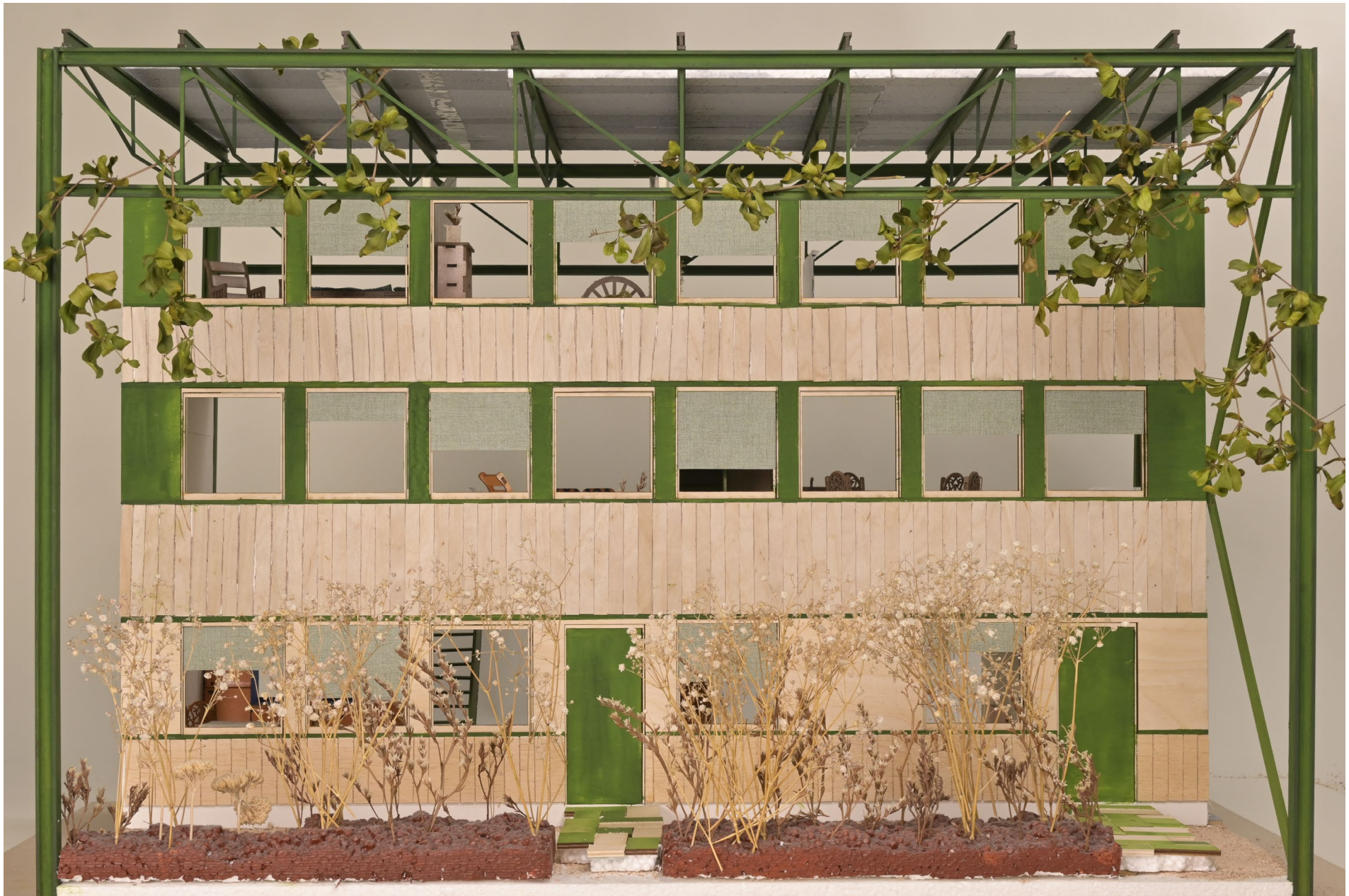
photographs of final model (1:20) - transformation & reuse: facade windows inspired by original trusses