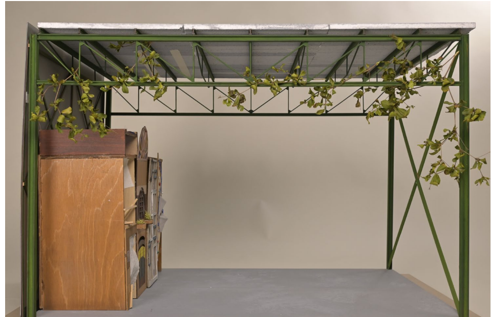
photographs of final model (1:20) - existing: as found - industrial hall with artists' ateliers