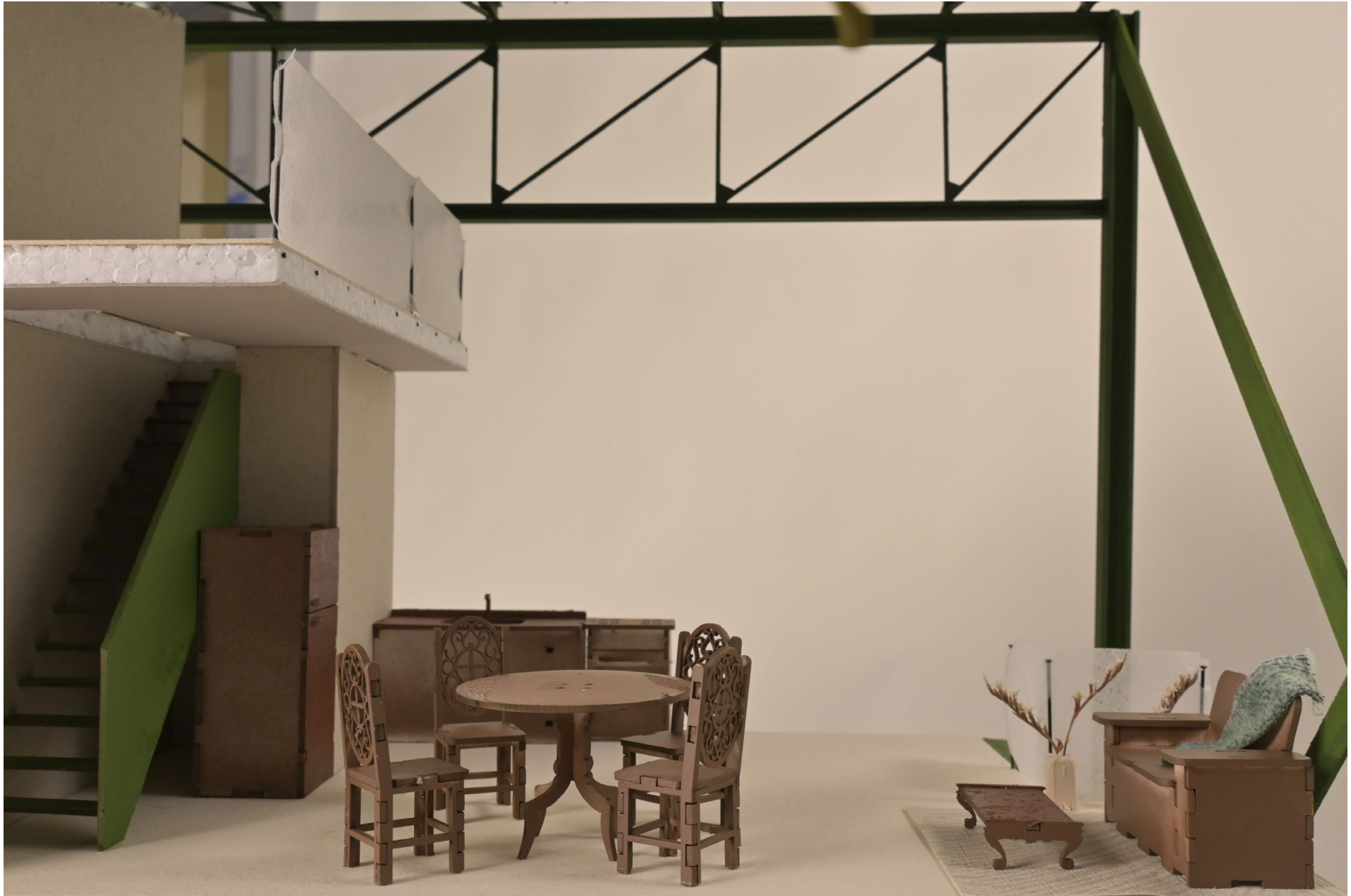
photographs of final model (1:20) - transformation & reuse: a family unit