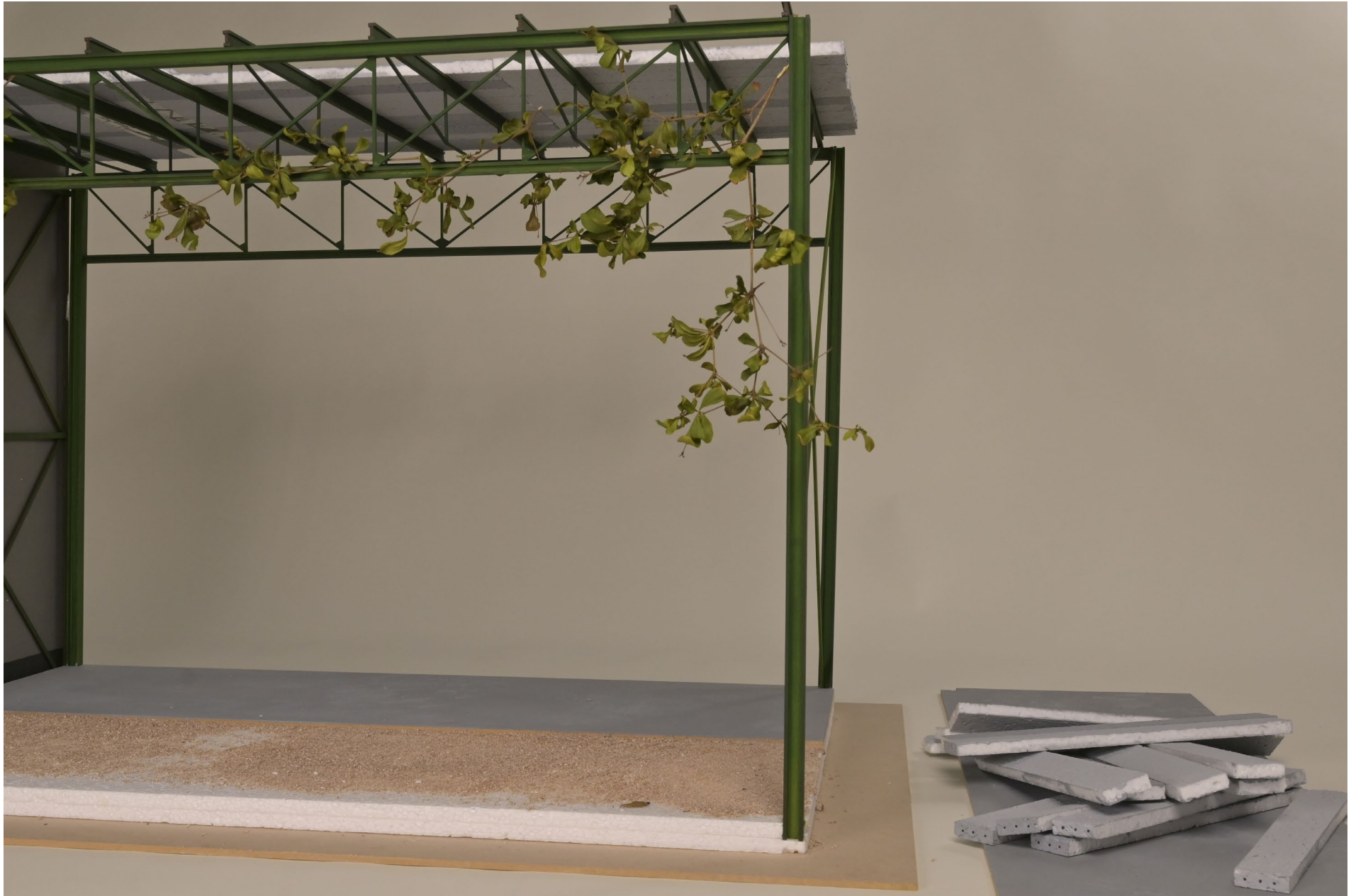
photographs of final model (1:20) - dismantle phase: taking out part of the roof and part of the concrete floor