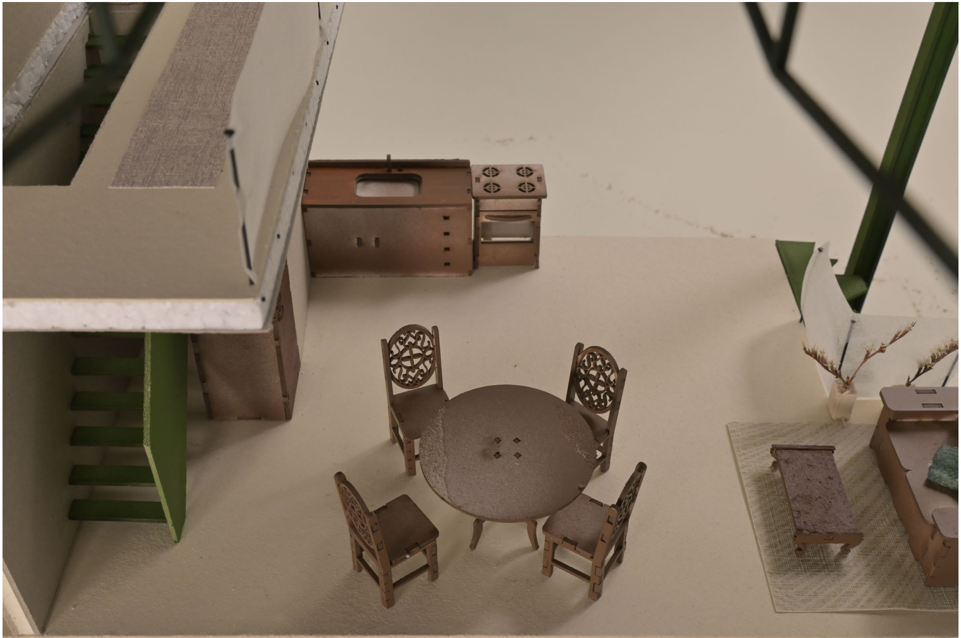
photographs of final model (1:20) - transformation & reuse: a family unit