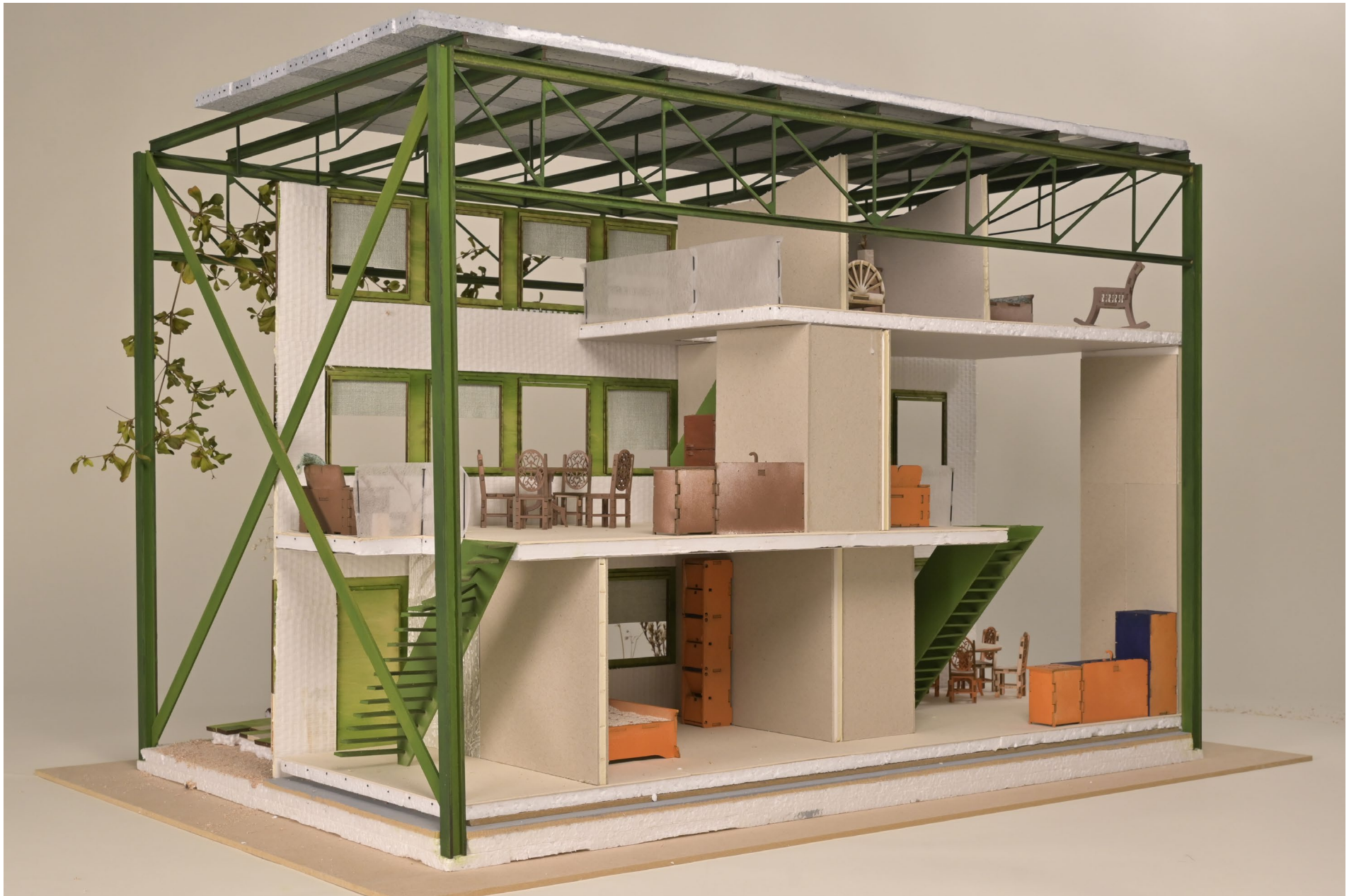
photographs of final model (1:20) - transformation & reuse