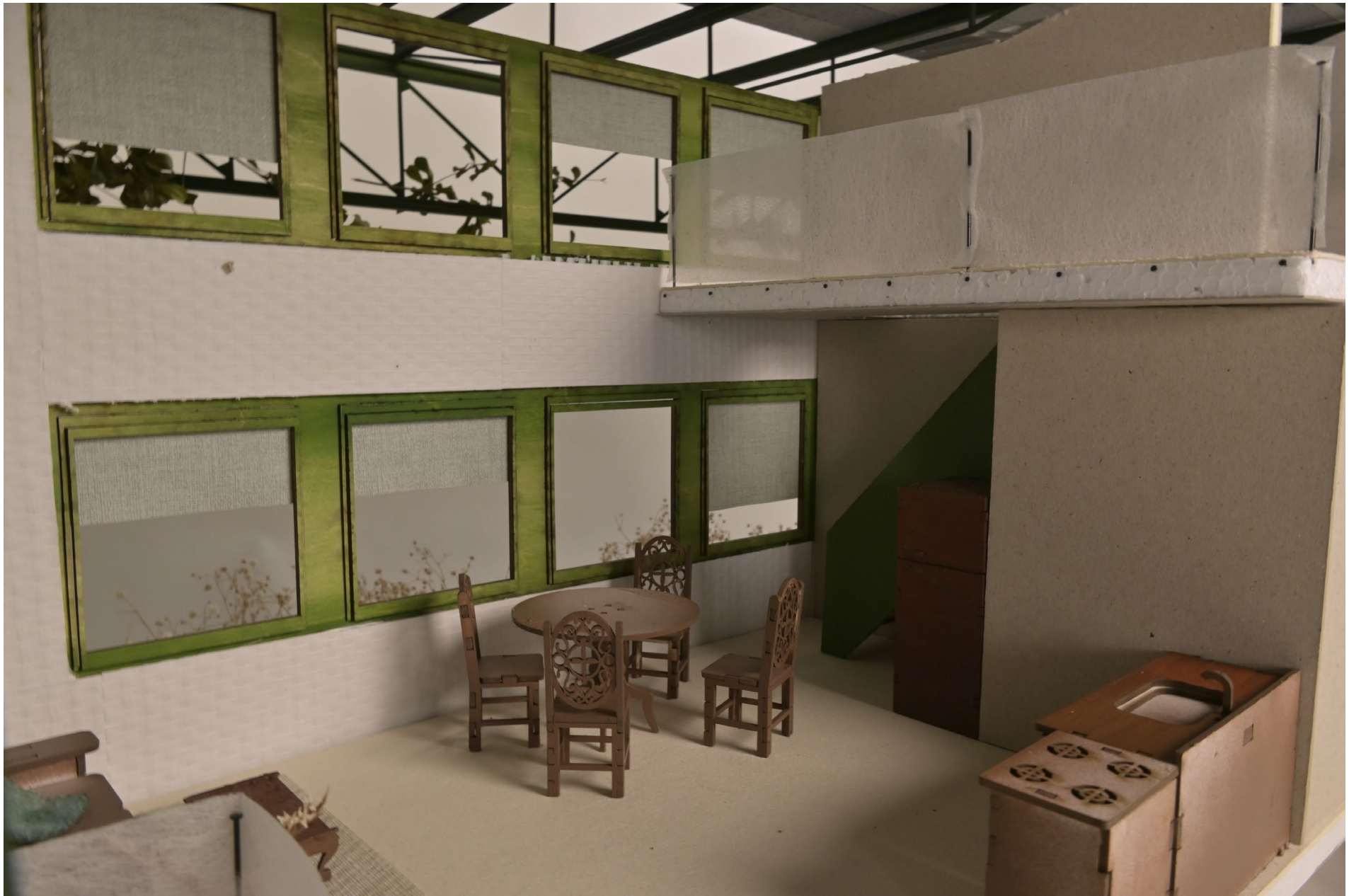
photographs of final model (1:20) - transformation & reuse: a family unit