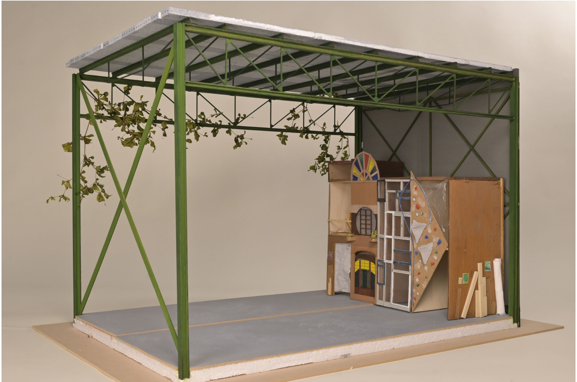
photographs of final model (1:20) - existing: as found - industrial hall with artists' ateliers