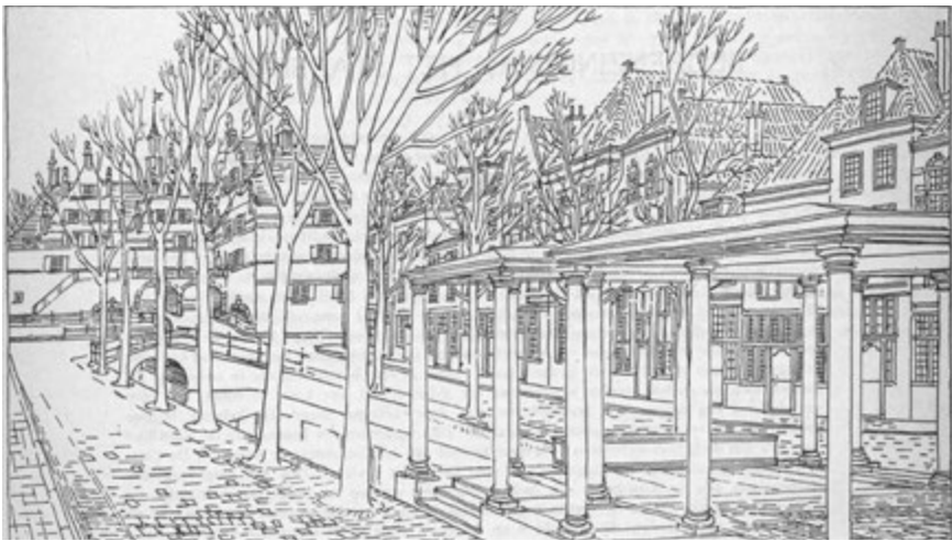
FIG. 5 In order to close off the streetscape and achieve '17th century urban planning effects', the Binnenwatersloot has been visually closed by building a new town clerk's office [from: Delft kunststad , 102]