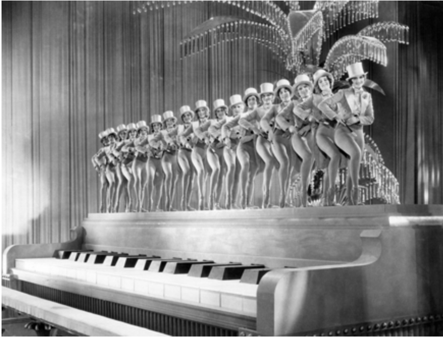
FIG. 1 Set design for the film King of Jazz (1930) [ https://harvardfilmarchive.org/calendar/king-of-jazz-2016-12 ]