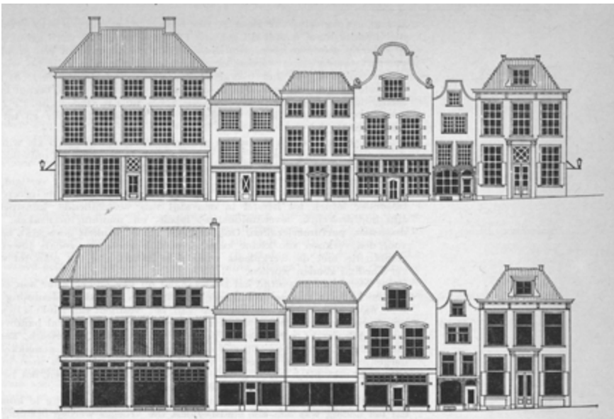
FIG. 4 The facades of the buildings along Wijnhaven from Boterbrug to Nieuwstraat; below, the existing situation; above, the proposed changes [from: Delft kunststad , 109]