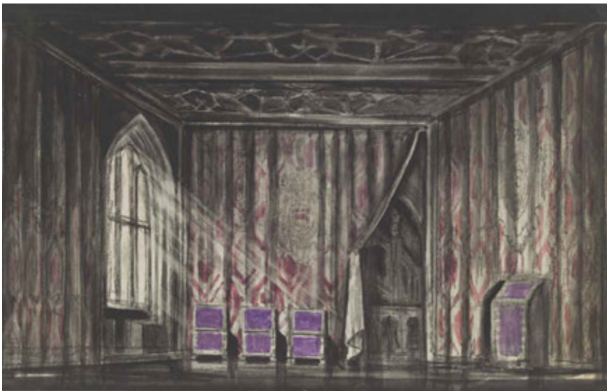
FIG. 2 Set design for Elizabeth, de vrouw zonder man by Toneelgroep Het Masker, 1936 [Allard Pierson, University of Amsterdam, Theatre Collection, t004206]