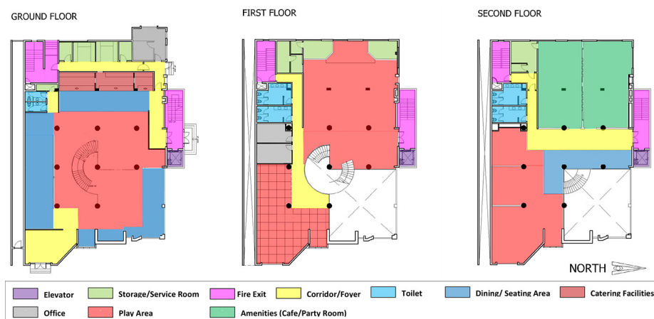
Figure 4. Floor plans of the new use (amusement center)