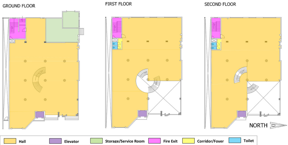
Figure 3. Floor plans of the previous use (bookstore)

endeavored on a change of use, to align the spatial layout of the facility with the new function.