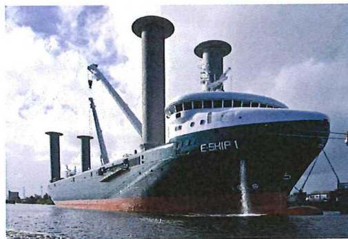
Figure 2. "E-Ship 1" of Enercon equipped with Flettner rotors.

There have been several studies on the aerodynamics of the propulsion systems mentioned above. In particular on the Turbosail [8], on the Flettner rotor [2] [18] [27] [10] [68], on the wind turbine [3] [34], on the wing sail [26] [44] and on the kite [53] [54]. These studies however always concerned a single propulsor. An exception is the Dynarig, for which wind-tunnel tests and CFD calculations have been performed also considering multiple rigs ([58] and [40]).