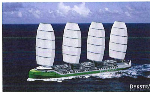
Figure 1. Render of the Ecoliner equipped with Dynarigs. Dykstra Naval Architects.

To make the performance prediction program a versatile design tool, the users should have the possibility to evaluate designs which employ different types of wind propulsion systems. Several types of propulsors have been proposed over the years. Arguably, the most common are the Dynarig, the Flettner rotor, the Turbosail, the kite, the wing sail and the wind turbine.