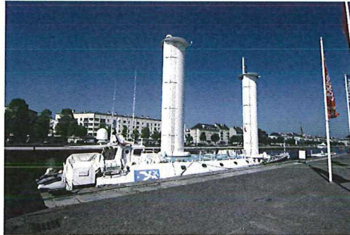
Figure 2. "Alcyone" of Cousteau equipped with Turbosails.

The first two effects can be associated with the production of lift, while the third effect can (primarily) be associated with drag. The main effect of the drag-generated turbulence on the velocity field is the reduction of the flow velocity. Therefore, it can be assumed that the interaction effects alter the velocity field mainly in two ways: reducing the incoming flow velocity and changing the incoming flow angle of incidence.