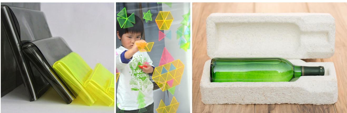
Figure 4. Materials potential can be articulated in relation to materials' structural and functional roles in product applications: left, Furoshiki Shiki, and middle, San Kaku Mado (triangles), made of sticky vinyl film, by Samira Boom (image source: left, Christien van Dokkum; middle, Nakano Ougi; reprinted with permission); right, wine packaging and photo by Ecovative (reprinted with permission).

Materials as the building blocks of products, charged with (sociocultural) meanings (Karana, 2009; Wilkes et al., 2016) play an important role in shaping our experiences of products (Karana, Hekkert, & Kandachar, 2008; Karana, Pedgley, & Rognoli, 2014). Ashby and Johnson (2002) acknowledge that the mechanical