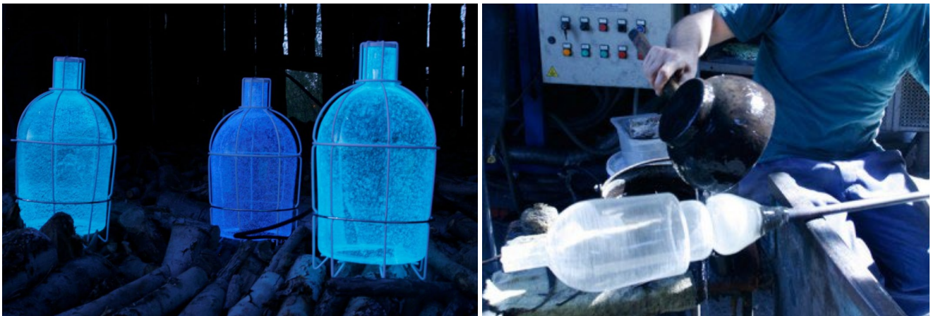
Figure 11. Designers exploit the potential for embedding photoluminescent pigments into the transparent body of glass, using a traditional technique: left, Trap Light by Gionata Gatto and Mike Thompson; right, Murano glass blowing process.