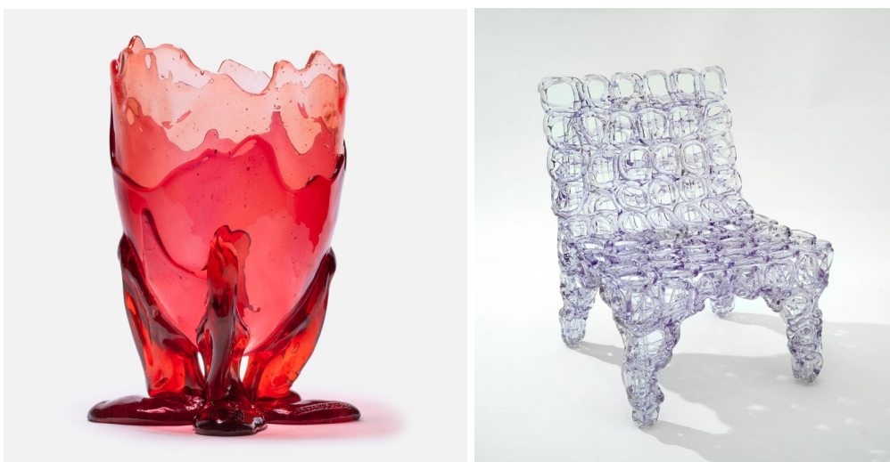
Figure 1. Designers push for novel forms by challenging the existing associations of plastics with “unified” and “perfect” machine-made forms: left, Clear Vase by Gaetano Pesce; right, Fresh Fat easy chair by Tom Dixon, 2001.

With the advancement of smart and computational materials, the temporal dimension of form has gained prominent attention, and is termed temporal form (Vallgård, Winther, Mørch, & Vizer, 2015). Temporal form in so-called computational composites is enabled by the computational structure, and materials enable the “material manifestations of temporal forms that enable our interactions with computational things” (p. 1). The temporal dimension of physical form, however, does not have a causal relation with computation, meaning that materials do not always