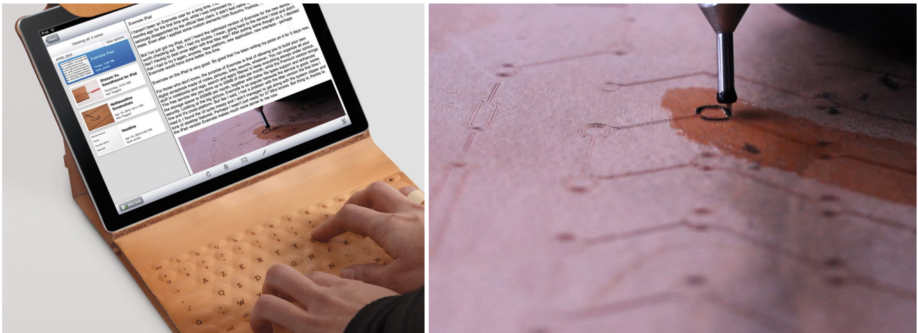
Figure 7. A novel potential of leather is unlocked through the skillful act of tattooing with conductive ink: left, iPad cover and keyboard INKO; right, the leather being tattooed with conductive ink (design and photo by Alexandre Echassieriau; tattooing by Tatoué and Jeremy Lorenzato; conductive ink: Bare Conductive; reprinted with permission).