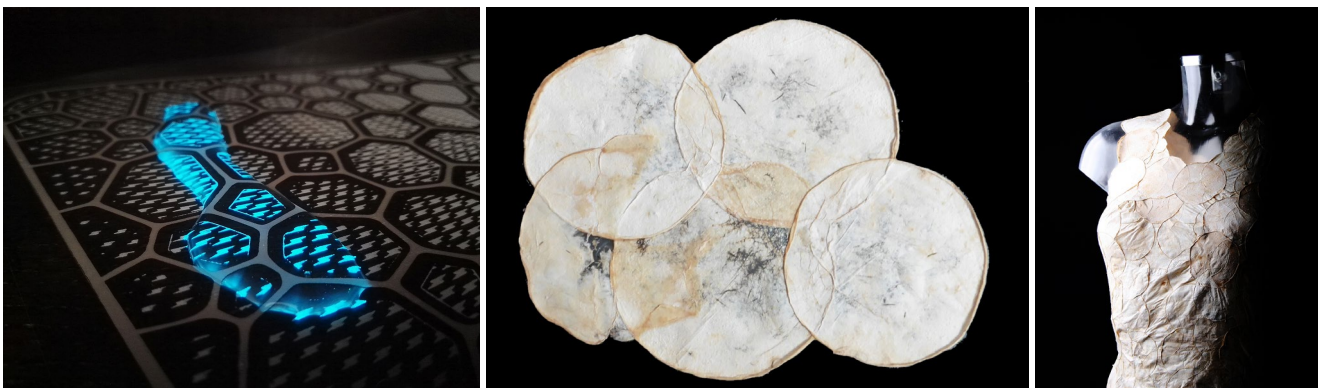
Figure 9. Discovery and perception of new affordances through materials experimentation: left, water-activated electroluminescent sample (design, fabrication, and photo by Stan Claus; reprinted with permission); right, MycoTEX textile and dress made from aggregated pure mycelium pieces by Aniela Hoitink | NEFFA (image source: Aniela Hoitink | NEFFA; reprinted with permission).

Invention of new tools/machines and repurposing, modifying, and combining existing production tools and techniques have been key to expanding novel affordances (for an overview, see Rognoli et al., 2015). The development of new machines such as multi-material 3D printers has enabled high-resolution control over dot deposition of soft, rigid, and transparent plastics in a single printed material. MIT Self-Assembly Lab showcased the possibilities of creating multi-material prints that can change shape "directly off the print bed" and termed this new way of production "4D printing" (Tibbitts, 2014). New ways of production such as 4D printing have further opened up unprecedented design opportunities in terms of form and experience, see for instance shape-shifting noodles by