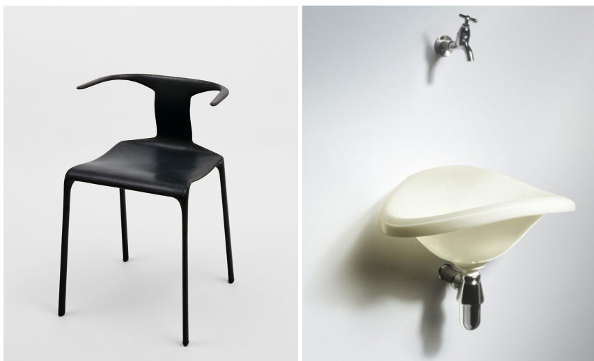
Figure 5. Understanding material potentials in relation to the experiences and performances elicited in interactions with products: left, Light Light chair by Alberto Meda; right, Soft Washbowl by Hella Jongerius, (production by Droog Design).

So far, we have shown how materials potential can be conceptualized in relation to the notions of form, function, and (materials) experience. Even though these notions are conceptually separated, in reality form, function, and experience as materials potential are rather intertwined, as they affect and result from each other. For example, a material might simultaneously enable surprisingly (i.e., experience potential) thin yet strong shapes (i.e., form potential) to sit on (i.e., function potential). However, such understandings of materials potential do not reflect how novel material potentials actually come about in creative practice. This may reinforce the