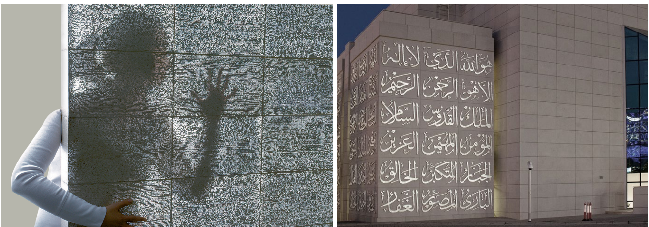
Figure 12. The previous practice of collaging glass and concrete materials next to each other is transgressed in the creation of light-transmitting concrete: left, precast building blocks by Litracon® (image source: Litracon®; reprinted with permission); right, Al-Aziz Mosque's light-transmitting façade (design, production, and photo by LUCEM Lichtbeton®; reprinted with permission).

and serVies by Annemarie Piscaer & Iris de Kievith). These creative practices with and through materials challenge the norms and conventions ascribed to materials, including their sociocultural meaning and their use. For instance, a realization of the potential of animal blood, discarded in large quantities by slaughterhouses, as a material source triggers Stittgen to further explore its “material-ability.” The designer exploits the known affordances of blood (e.g., to dry) to process it into a powder that can then be heated and pressed into a black, solid material. The process uncovers and exploits novel affordances of blood, or more specifically albumin protein, to act as a binding agent, in creating a protein-based biopolymer that is 100% processed blood.