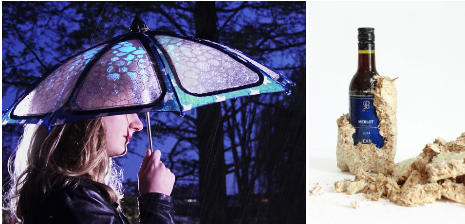
Figure 6. The experiential potential of materials: left, the umbrella pushes for a novel experience of rain, through the custom-made water-activated EL print (designed by Stan Claus; image source: Weirisma Brothers; reprinted with permission); right, mycelium-based packaging design, by Davine Blauwhoff, offers a distinct unboxing experience (reprinted with permission from Davine Blauwhoff).

view that material potentials are materials' ever-existing effects awaiting the creative mind to recognize them, independent of the fluxes of the creation process, the designer's skills, the properties of the medium used to communicate the material (e.g., technical information, video of the making process, the processed material, or the ingredients), the social context (who the designer interacts with), time, and place (what equipment the designer has access to).