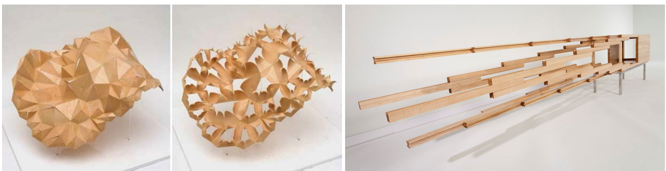
Figure 3. The passive (left) and active (right) role of wood in conceptualizing kinetic forms: left, shape-changing wooden veneer; right, Explosion Cabinet by Sebastian Errazuriz (image source: left, Steffen Reichert, 2008; right, Carnegie Museum of Art, Pittsburgh, Women’s Committee Acquisition Fund; reprinted with permission).