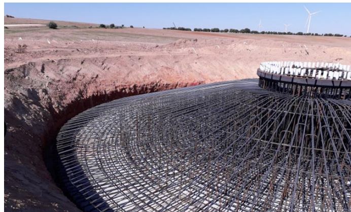
Figure 1: Typical reinforcement cages of reinforced concrete shallow foundations for onshore wind turbine towers (from [1]).

Wind turbines represent a convenient source of renewable energy and their diffusion is a fundamental step for reducing carbon dioxide emissions, main responsible for global warming. Turbine towers are characterized by large heights, therefore the wind load induces considerable bending actions at the base of the structure. Although, especially offshore, deep foundations are usually adopted, shallow foundations are still an option in case of onshore installations [1]. These circular shallow foundations are massive concrete structures (Figure 1) that counteract the bending moment with their own weight. The optimization of the design and the extension of the service life are fundamental from both economic and environmental perspectives. These will increase the competitiveness of energy production from renewable wind sources over fossil ones, thus boosting the transition toward sustainable energy.