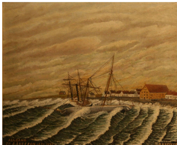
Figure 4. Oil painting of the ship Albano being wrecked in Simrishamn, painted by H. Kappelin.

There has been little documentation about the effects of the 1872 storm in Sweden until the recent publications by Feldmann Eellend [59] and Fredriksson et al. [12]. The 1872 storm mainly impacted the southern and eastern coast of the county Skåne, where at least 23 people lost their lives and more than 100 houses were destroyed [12]. Among the deceased, five people were pulled out from land by large waves in Simrishamn on the east coast, whereas the others were lost at sea. Figure 4 shows a painting of a shipwreck in Simrishamn, where high water levels coincided with large waves.