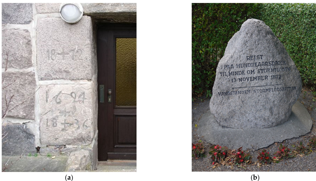
Figure 3. (a) Flood marks from 1694, 1836, and 1872 on a building in Schleswig, Germany. Photo: R. Sedlatschek; (b) Flood mark at Gedesby church (Gedser, Denmark) to memorize the 100th anniversary of the 1872 storm surge. Photo: Wikipedia.org.

Instead, studies of other historical storm events can supplement the analysis of the prevalence of storm surges of the same magnitude as the 1872 storm. Several historical storm surge levels have been estimated based on flood marks (Figure 3) and information in German and Danish literature [13,42]. The earliest reliable record of a Baltic storm surge dates back to 1044 [13]. More precise records of storm surges are available from 1304, 1320, 1625, 1694, 1784, and 1835, but they most likely had lower peak water levels than the 1872 storm [15]. In Travemünde, the water level was estimated to have reached 3.1–3.2 m above normal sea level at its peak in 1320 and 2.84 and 2.86 m in 1625 and 1694, respectively [13]. However, it should be noted that these estimates are very uncertain considering the difficulties of estimating the normal sea level at those times. Further, climate change and variability make it difficult to use historical events for extreme value analysis and extrapolation in the future. For instance, the prevailing wind directions in the south Baltic Sea have changed over the last centuries, influencing the probability of extreme storm surges [43,44].