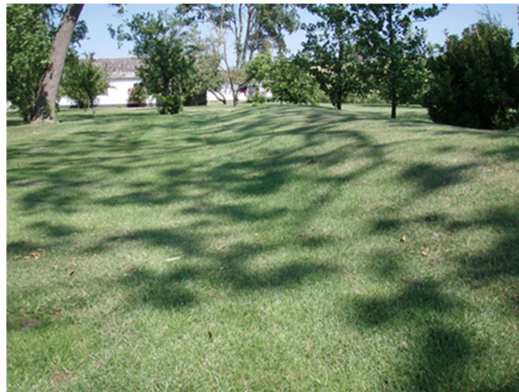
Figure 5. Remnants of a dike on the Danish island of Omø constructed after the 1872 storm, but later partly removed.

Along the Danish coast, other minor dikes were built to protect against a similar storm. However, as time passed without any storm surges reaching close to the 1872 storm surge level, flood risk awareness diminished. For example, the dike on the island of Omø that was constructed after the 1872 storm surge was later partly removed (Figure 5).