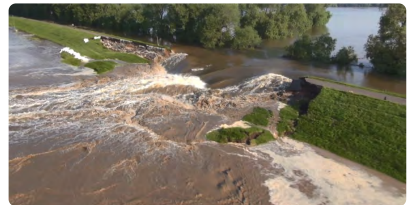
Figure 1: Dike failure in Breitenhagen, Germany.