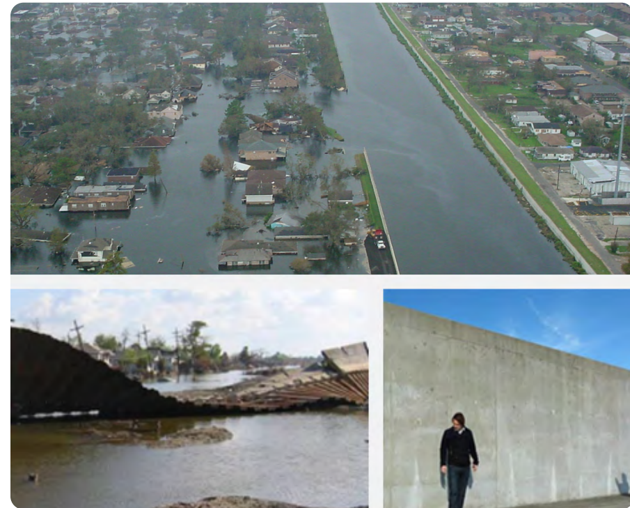
Figure 2: Top and bottom-left: Floodwall failure on 17 th Street Canal from Hurricane Katrina in New Orleans. Bottom-right: Rebuilt New Orleans floodwall in 2013.

Our research helps in better understanding failure mechanisms for optimising the design of flood defences to better comply with the new flood protection standard. Some of the unique topics that I'm working on as a daily supervisor of the following PhD researchers are (related projects):