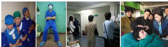
Fig. 3 Lack Of Support Space

While interviewing with medical staffs, the inadequate setting of lounge is the main problem in the design. The working intensity in ICU is extremely large (Figure 1). Average working time is about 10 hours. Providing adequate lounge is very necessary. But in the reality, many medical staffs have no lounge, and they can only rest in the dressing room (Figure 2).