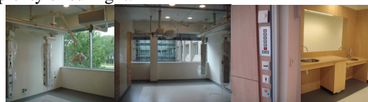
Fig. 8 ICU In Catharina Hospital Fig. 9 ICU Room Clean design

general design of windows so as to enable the patient lying on the bed can see the trees and blue sky outside through the window. Light can affect the patient's psychological, and patients need plenty of sunlight.