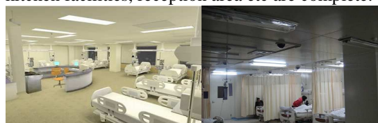
Fig. 1 China's Icu Ward

In the survey, we find that hospitals in China focus on the quality of ICU ward, but seldom care about supporting space; while those in Netherlands, the supporting spaces including storage area for case notes, relatives' rooms, kitchen facilities, reception area etc are complete.