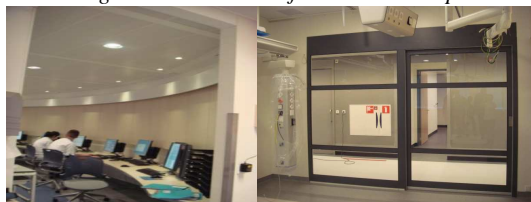
Fig. 6 Central Nursing Fig. 7 ICU Of Catharina Hospital Tationin