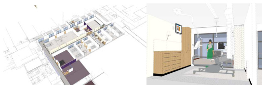
Fig. 4, 1 ICU Unit Of Catharina Hospital