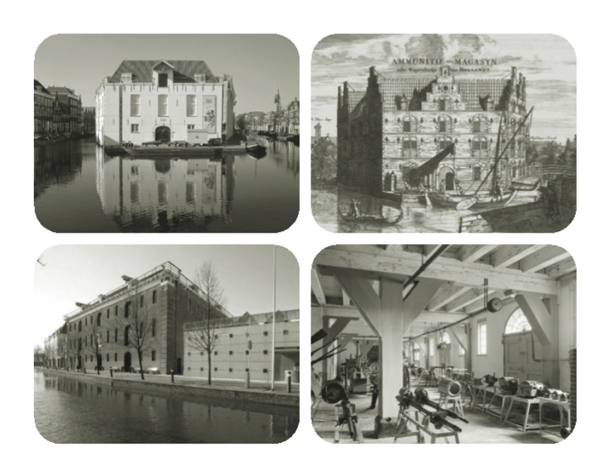
THE ARMAMENTARIUM, EPISODE NO.8 GRADUATION PLAN - D.P.Landman - 1049518 - RMIT