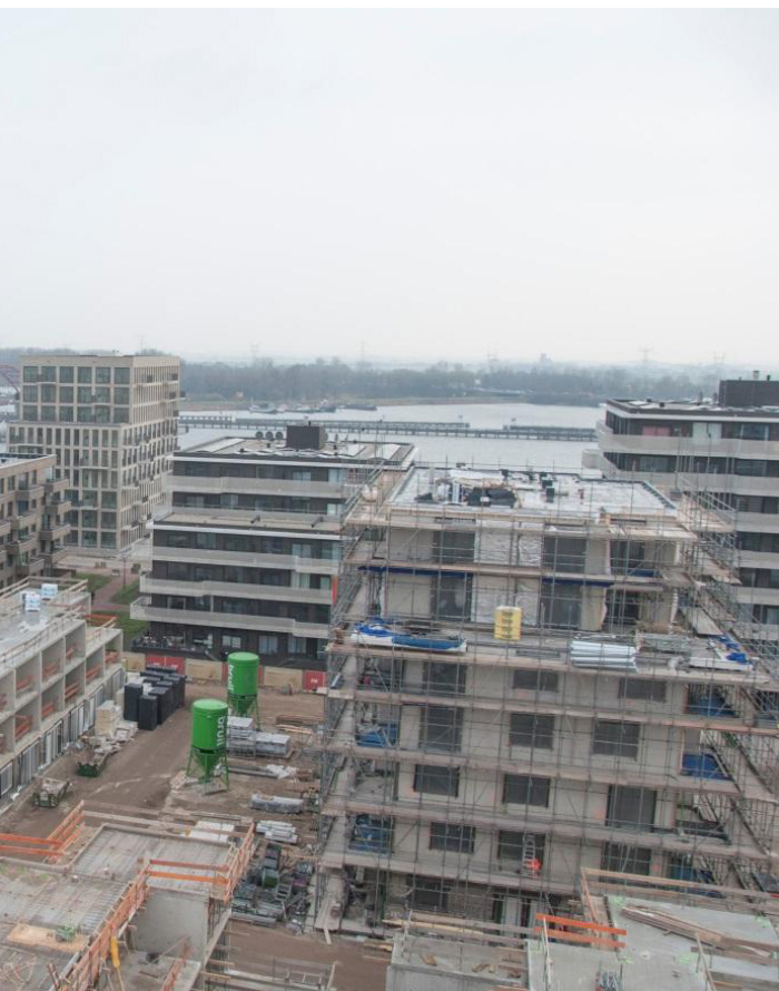
Figure 1. Theo Koomenbuurt under construction

Parties in the Theo Koomenbuurt have used a flexible spatial framework as a master plan, which contains remarkable features. A spatial agreement contained ten general spatial rules for the site