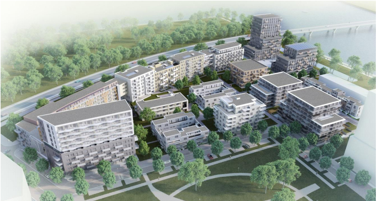
Figure 3. Theo Kooenbuurt upon completion

Finally, from a Dutch development culture point of view, it remains to be seen whether both public planning authorities and private development companies are institutionally receptive and behaviourally responsive to these (new) forms of privatization in Dutch urban development practice.