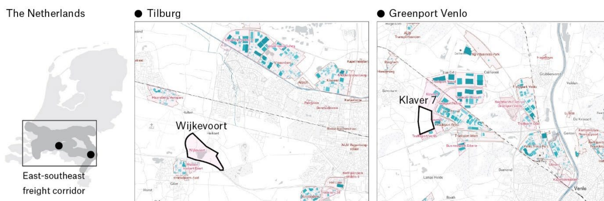
Figure 1: The cases in the logistical hinterland of the Netherlands

Logistics development Klaver 7 (Horst aan de Maas municipality) is the most recent phase of the ongoing Greenport Venlo development, following the 2009 masterplan including simultaneous realization of ecological and recreational zones in the area (Nefs and Daamen, 2022). The expansion of ca. 60 hectares should attract logistics and local small-medium