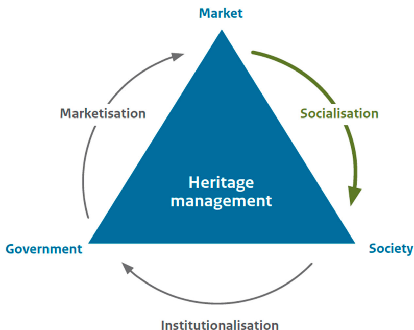
Figure 2. Welfare state reform and heritage management: from institutionalization and marketization to socialization.

What connects the different approaches is their emphasis on a careful interpretation of history. The main difference lies in how they frame heritage issues and, subsequently, interpret the relationship between heritage and development. Whereas the heritage as sector approach tries to protect heritage from spatial development, the heritage as vector approach, on the other hand, sees heritage as product of a social process and uses it as a place-making tool. Dealing with heritage has broadened from an inward-looking, technical and instrumental perspective focused on the ‘intrinsic’ value and materiality of heritage towards a more open, strategic and political perspective, in which it is understood as the product of a broader social context, and in which immaterial dimensions also play a role (Figure 3). This entailed a shift from logical positivism based on empirically observable and verifiable historical data to social constructivism, which allows scope for emotion and engagement, different cultural perspectives and various forms of appropriation (cf. Harrison, 2013).