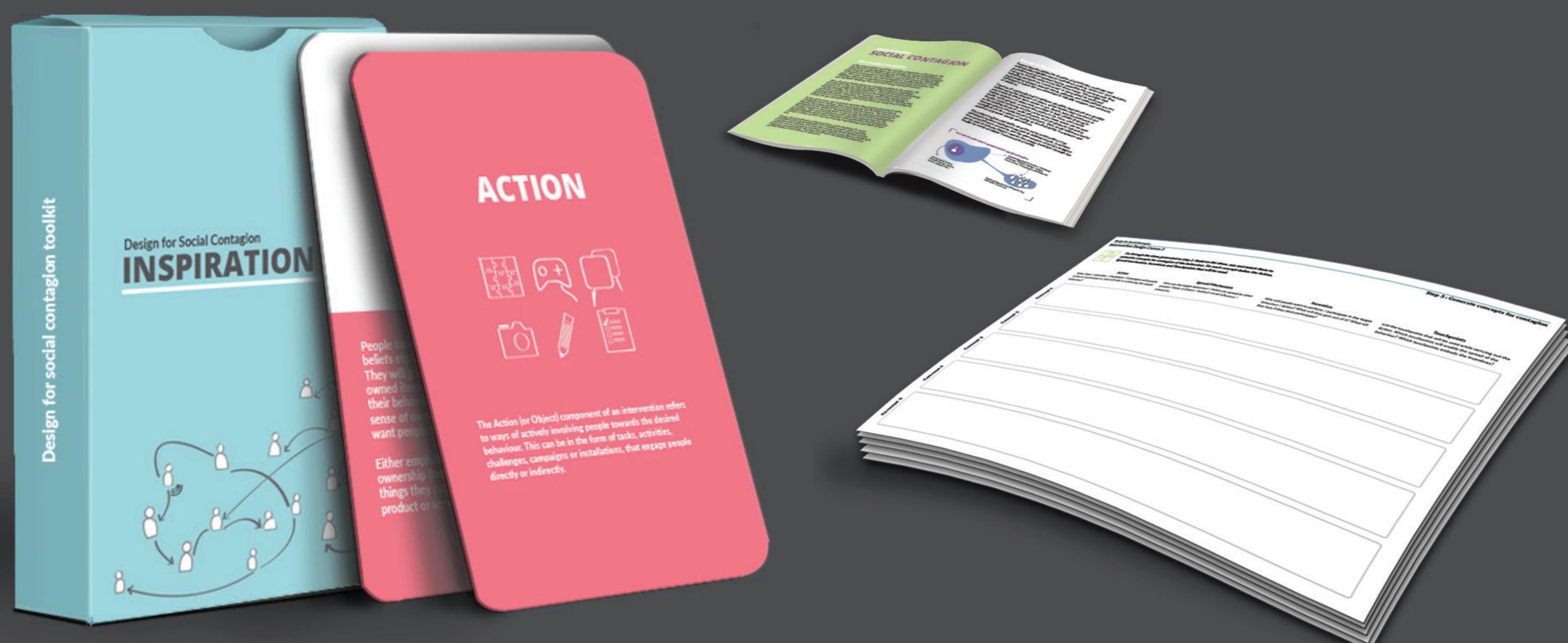
Figure 2: Design for social contagion toolkit

Jesal Shah Social contagion as a means to transitions 24 th August 2020 Strategic Product Design