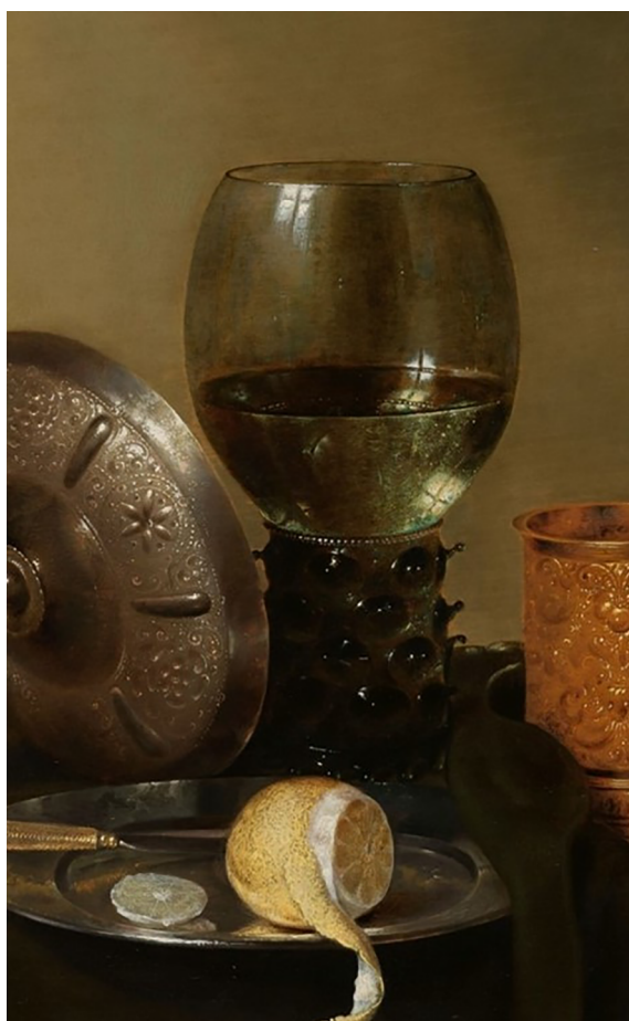
Figure 4. Detail of Willem Claesz. Heda, Still Life with Gilded Beer Jug , 1634. Rijksmuseum, Amsterdam, The Netherlands. The image is available in the public domain.

Beurs in his book foresaw elements of ecological optics by laying the foundations of materials’ depiction onto the observation of natural illuminations and natural environments. He also understood the relevance of grasping the physics of optical phenomena, while at the same time acknowledging that there is no need for complex mathematical computations. For example, he remarks that the painter is not required to embark on the calculations of refractive indices to paint a smooth, fragile and transparent glass of wine (as the one in Fig. 4) (Beurs, 1692; Lehmann and Stumpel, in press).