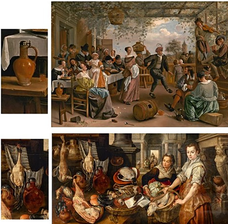
Figure 3. Examples of key features for material depiction and perception. The ceramic jugs show sharp and bright, window-like specular reflections on the metal cap despite the illumination conditions. On the left is shown the detail with the jug and, on the right, the entire painting. (Above) Jan Steen, The Dancing Couple , 1663. National Gallery of Art, Washington, DC, USA. (Below) Joachim Beuckelaer, Christ in the House of Martha and Mary , 1568. Museo del Prado, Madrid, Spain.

The term ‘key features’ here means that the established image features proposed by Beurs to render different materials work as perceptual cues regardless of the illumination and viewing conditions. For example, when painting a polished ceramic jug with a shiny metal cap, it does not matter whether one places it in an outdoor shaded patio, as in Fig. 3 (above), or even behind the shadow of a hung duck, as in Fig. 3 (below). The jug invariably shows sharp, high-contrast specular reflections on the cap, and these cues will always