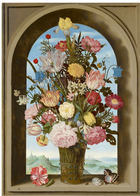
Figure 2. Ambrosius Bosschaert the Elder, Vase with Flowers in a Window , 1618, Mauritshuis, The Hague, The Netherlands.

Painting naer het leven was not the only approach, and not always feasible, especially with quickly decaying subjects like food and flowers, or with expensive goods like jewels and luxurious fabrics. The detailed observations could be enhanced and dramatized in the studio as desired, by painting uyt den gheest (from memory), and by relying on established recipes and conventions like the ones to be found in Beurs’ treatise. A famous example is the Vase with Flowers painted by Bosschaert (Fig. 2), portraying an impossible bouquet meticulously rendered but illuminated by impossible lighting. In this painting, the mastery of Bosschaert in the stofuitdrukking or ‘expression of stuff’ (Wiersma, 2020), of each flower is the center of attention, at the expense of