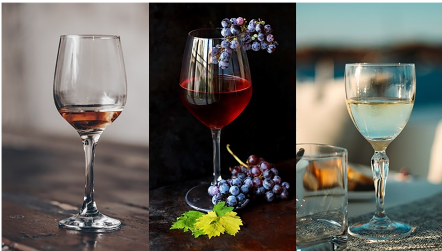
Figure 5. Professional photographers tend to prefer a pattern of specular reflections on wine glasses similar to that used by Dutch 17th-century painters to depict glasses.

It was noted by Hagen (1980) that applying the theory of ecological optics of Gibson (1961) to the representation and perception of pictures, means that “pictorial styles succeed as representations only to the extent that they capture invariant information for the objects and scenes pictured.” The hypothesis