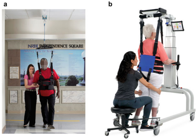
Fig. 33.2 Passive body weight support devices. a Zero-G passive, b LiteGait