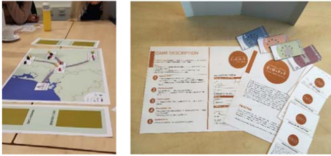
Fig. 1. Prototype of the Trust Game