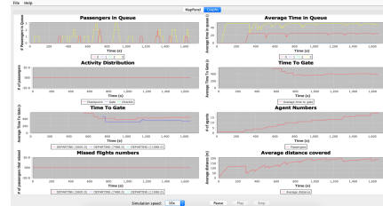
Fig. 2. AATOM analyzers.