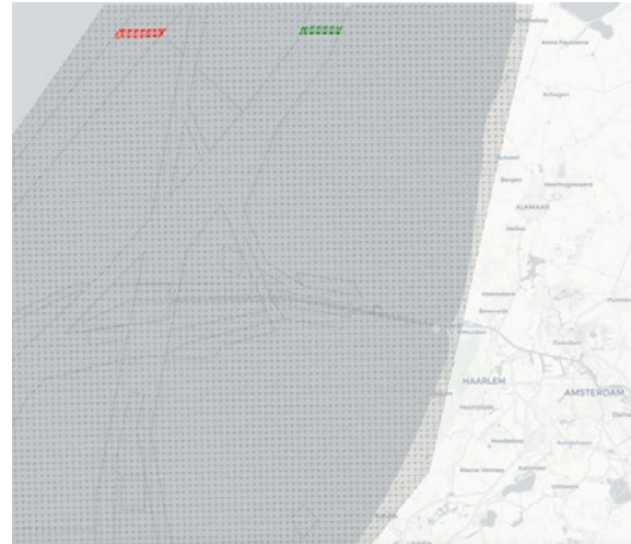
Figure 3 The evaluated crossings in the main shipping lanes indicated in red and green

speeds decrease. From the behaviour perspective, we could evaluate this further, refer to Table 2, presenting multiple trips of a single vessel crossing the sections in Figure 3. The same speed reduction can be recognized, as observed in Figure 4. By looking from this perspective, other factors, like the vessel draught or its relative heading with respect to the waves can be considered.