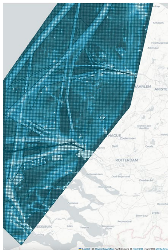
Figure 2 Spatial grid with colour indicating shipping intensity

Behaviour of vessels can be influenced by external factors, but it may also influence the performance of the overall system. This is what the behaviour perspective considers. For example, weather conditions can influence the vessel's timeliness or energy use, because it may sail against currents and winds, or because it adjusts its speed to cope with unfavourable wave conditions. The most important requirement to evaluate the system from this perspective, is to know the sequence of events that were part of a single case, in the right order. This is simply achieved by adding timestamps to each event. This evaluation may furthermore consider the routes taken for a given origin-destination, and potential deviations from the ordinary.