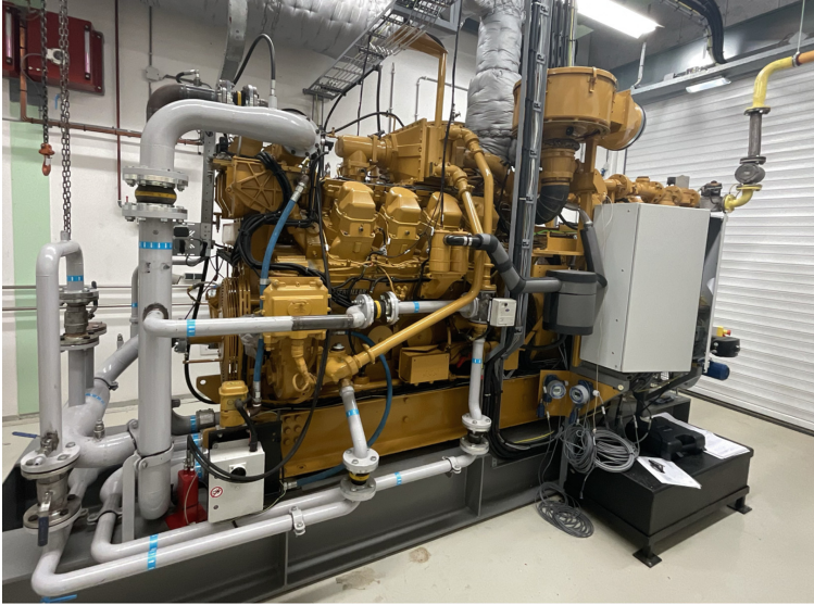
Fig. 2. The HD Marine four-stroke SI engine experimental setup in Den Helder, Netherlands