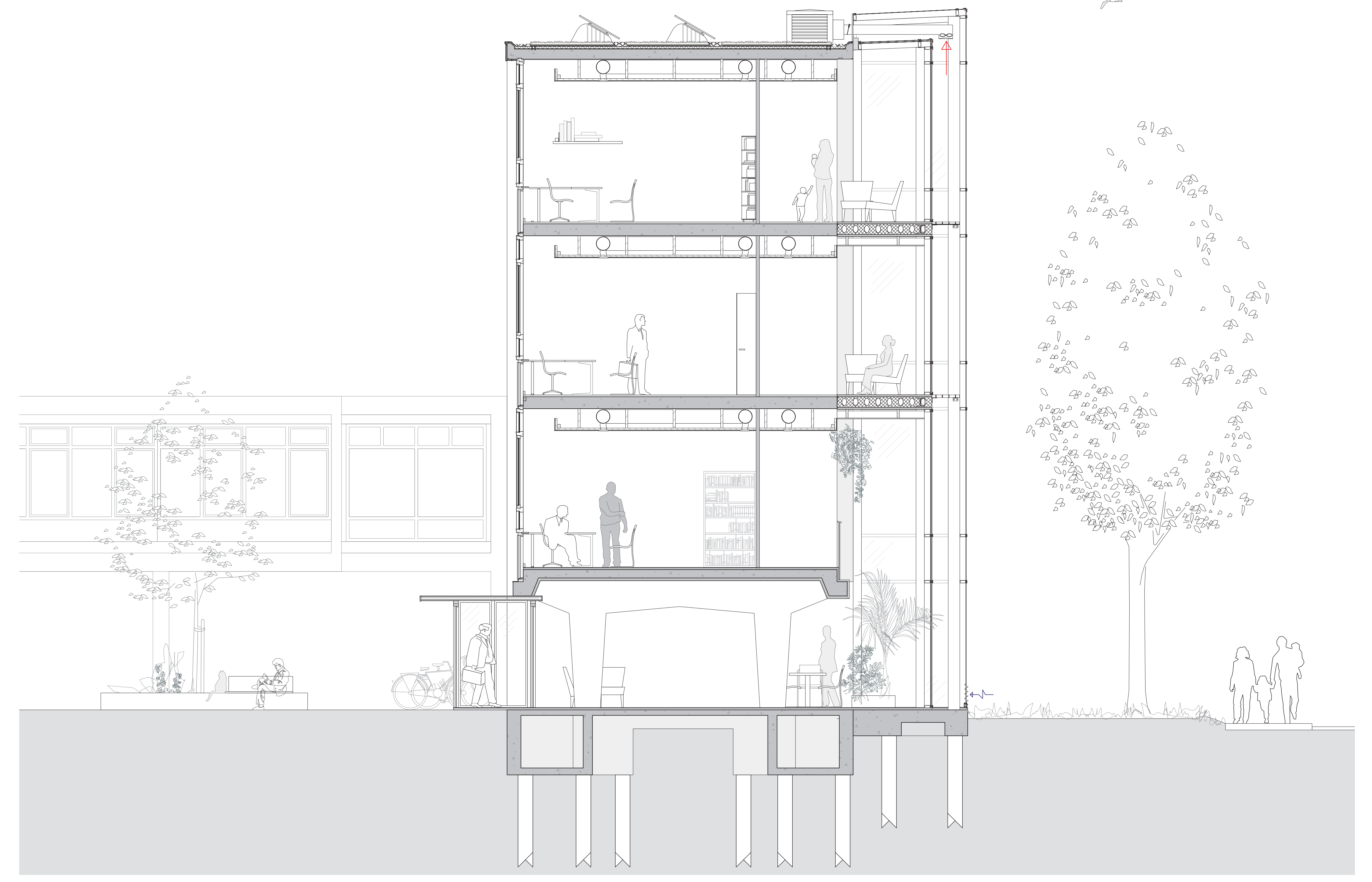
Doorsnede Zuid schaal 1:100