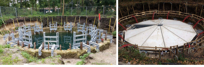
Fig. 2. Construction of the STESS. Left: installation of the last heat buffer. Right: STESS almost completely sealed.

for thermal stratified vessels proposed in [47], the dynamics of each heat buffer i at time k can be defined by