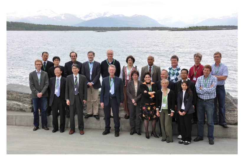
Figure 2. ISO 19152 Editorial Committee, Meeting in Molde, Norway, May 2009.

The standard has been developed by experts from all over the world: UN Habitat Land Tenure Section with its comprehensive knowledge on customary tenure systems, EU Joint Research Centre with a broad knowledge base on INSPIRE and LPIS, the United Nations School for Land Administration Studies and experts from Land Administration and Cadastral organisations, universities and normalisation institutes. See Figure 2.