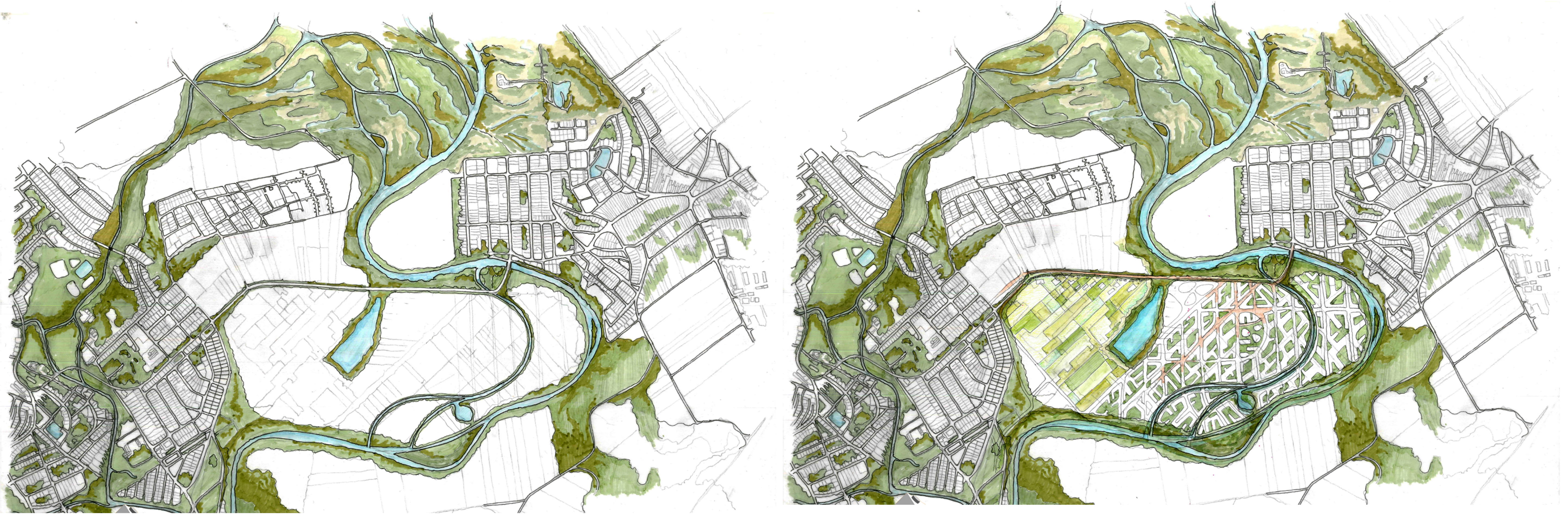
first the region: rehabilitated landscapes of mitigation, a more consistent water system, then the region with the camp: more economy and better services, then the camp, productive and autonomous