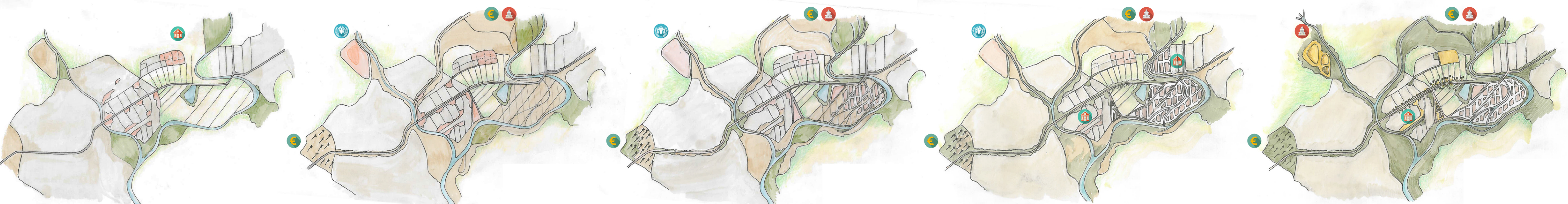
Shaping of a camp within a regenerated region: from the temporary settlement to the first production infrastructures, connected through green, blue and grey networks