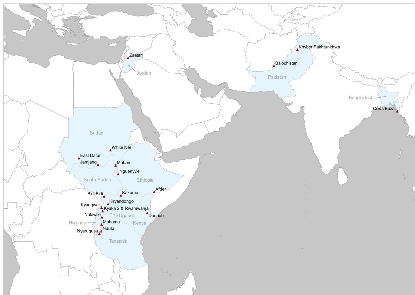
Fig. 1. Locations of the 20 largest refugee settlements. This figure shows the locations of the 20 largest refugee settlements that we included in our analysis. The red triangles indicate the settlements, and the countries highlighted in blue are the countries that host these settlements. Some countries are host to multiple refugee settlements. Information about the locations of the settlements was derived from multiple sources, including UNHCR reports.

To address this gap, this article uses climate and weather data, combined with UNHCR data on the geographic locations of refugee settlements, to study the exposure of the 20 largest refugee camps worldwide to extreme weather conditions between the 1980s and 2020. The 20 largest formal camps that constitute our sample jointly host over 4.5 million of the estimated 6.6 million refugees that reportedly lived in camps in 2021 with a further 2.1 million residing in informal or other camps (22). Informal or non-UNHCR mandate camps were excluded as data are difficult to obtain and self-settled or informal camps may imply a degree of integration and self-reliance not often witnessed in formal encampments. Selecting the 20 largest refugee settlements gives a comprehensive overview of the exposure to climatic events of refugees residing in areas in which adaptation and absorption capacities are limited.