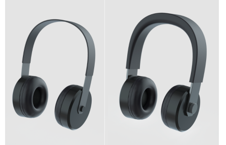
Figure 1. Example stimuli of breakable (slender/breakable) and solid/durable (right) headphones used in this study.

In a within-subjects design, we exposed 76 participants with experience in design (48 females; age range: 20-59, M=26.5; years of design experience: 1-35 years, M=6.14) to six blenders and six headphones. Participants rated all stimuli on several 7-point scales (see appendices). The pre-test results demonstrated that the stimuli significantly varied in attractiveness (Bell et al., 1991) and durability (Mugge, Dahl, & Schoormans, 2018) (all p's <.05). Furthermore, the stimuli had a similar level of performance quality and ease of use (Grewal et al., 1998; Mugge et al., 2018) (all p's>.05) to rule out that these factors would have an additional effect on our findings (see appendices).