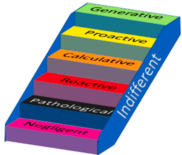
Fig. 3. extended culture ladder (). adapted from Hudson, 2007

As was described in Ale et al. (2020), resilience has obtained a more and more ominous meaning, which supports the idea that when relying on the resilience of the people involved, precautionary measures such as spare capacities in stocks are both unnecessary and unjustified, in view of the opportunity costs of committing money for events that may not happen. There is the view (Jongejan et al, 2011) that preparing for low