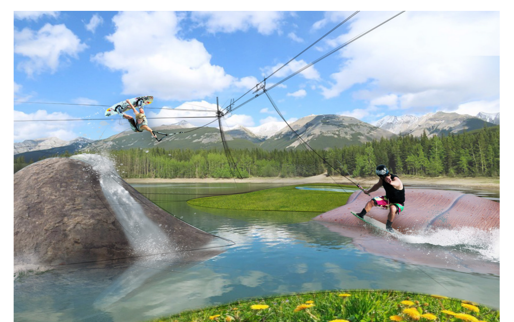
Figure 3: The Pad with the future vision of the new generation in wakeboarding.

Wouter Potma A new generation in the evolution of wakeboarding The design of a feature within the vision to enrich the experience of Entertainment Enjoyers 4th of June 2018 Integrated Product Design