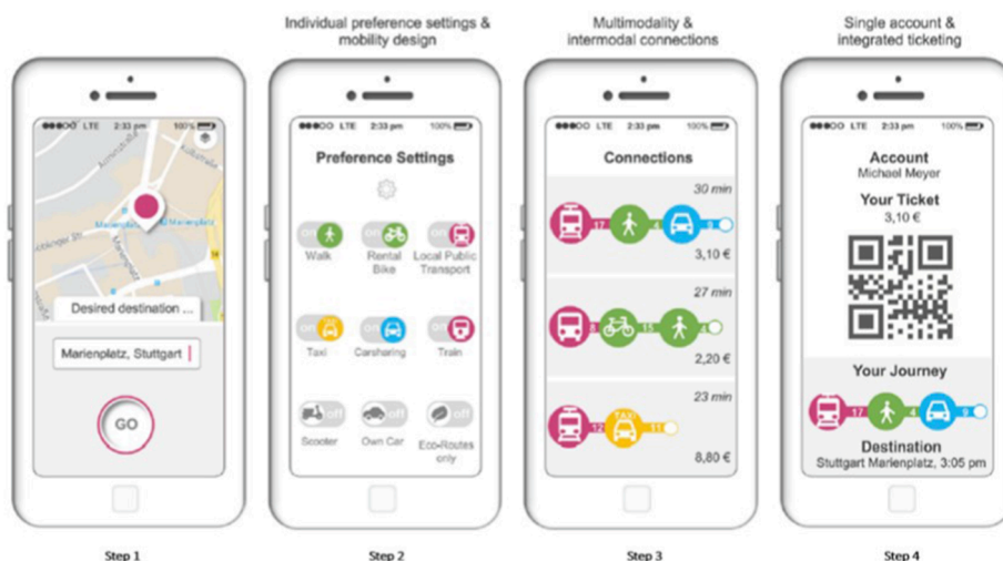
Fig. 2. Explanation of MaaS given in the questionnaire.

To illustrate: a traveller opens the MaaS app to see what the best transport option is for the journey between home and work. The traveller indicates in the app that active modes (walking or cycling) are not preferred since it is raining. The app shows that the traveller should use a shared car to the train station and then the train to work. Directly driving to work with the shared car today is discouraged by the app, because the real-time traffic data show that the highway to the work address is congested. The traveller pays for this way of travelling in the app and begins the journey to work.