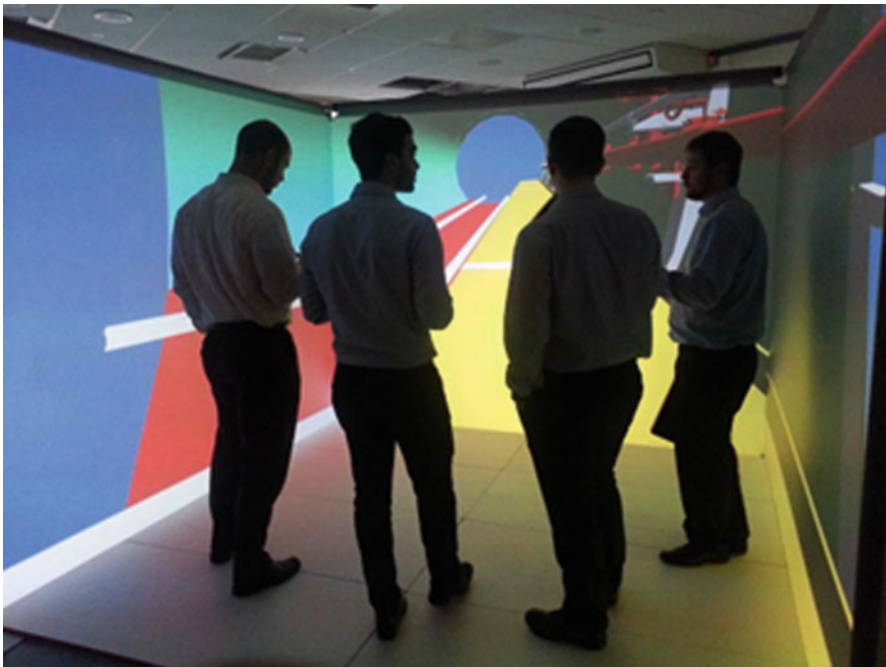
Fig. 10.2 Collaborative visualisation in 3D Move. (Nikolić et al. 2019)

An example of collaborative design visualisation is 3D MOVE (Mobile Visualisation Environment), developed at the University of Reading. It is a collaborative tool for multiple users to interact with and explore full-scale 3D models and built environments (see Fig. 10.2). A study of this technology showed that using collaborative VR environments like 3D MOVE can give project teams more ability to question, evaluate, and justify design decisions (Nikolić et al. 2019), resulting in improved design performance and efficiency and reducing resources needed to build the asset. There are commercial offerings that provide collaborative design visualisation capabilities for the construction industry. For example, Mission Room and Fulcro Fullmax are two companies that offer semi-immersive hardware solutions for construction projects. They use software solutions such as Revit, Unity Reflect, BIM 360, and Fuzor for their software workflows.