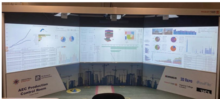
Fig. 10.3 Collaborative data visualisation in AEC Production Control Room

Construction AR enables construction professionals to interact with digital models and information overlaid onto the physical environment, which can play a significant role in helping the industry achieve circular transition strategies that include narrow, slow, and close concepts. In the narrow approach, AR can optimise resource use by