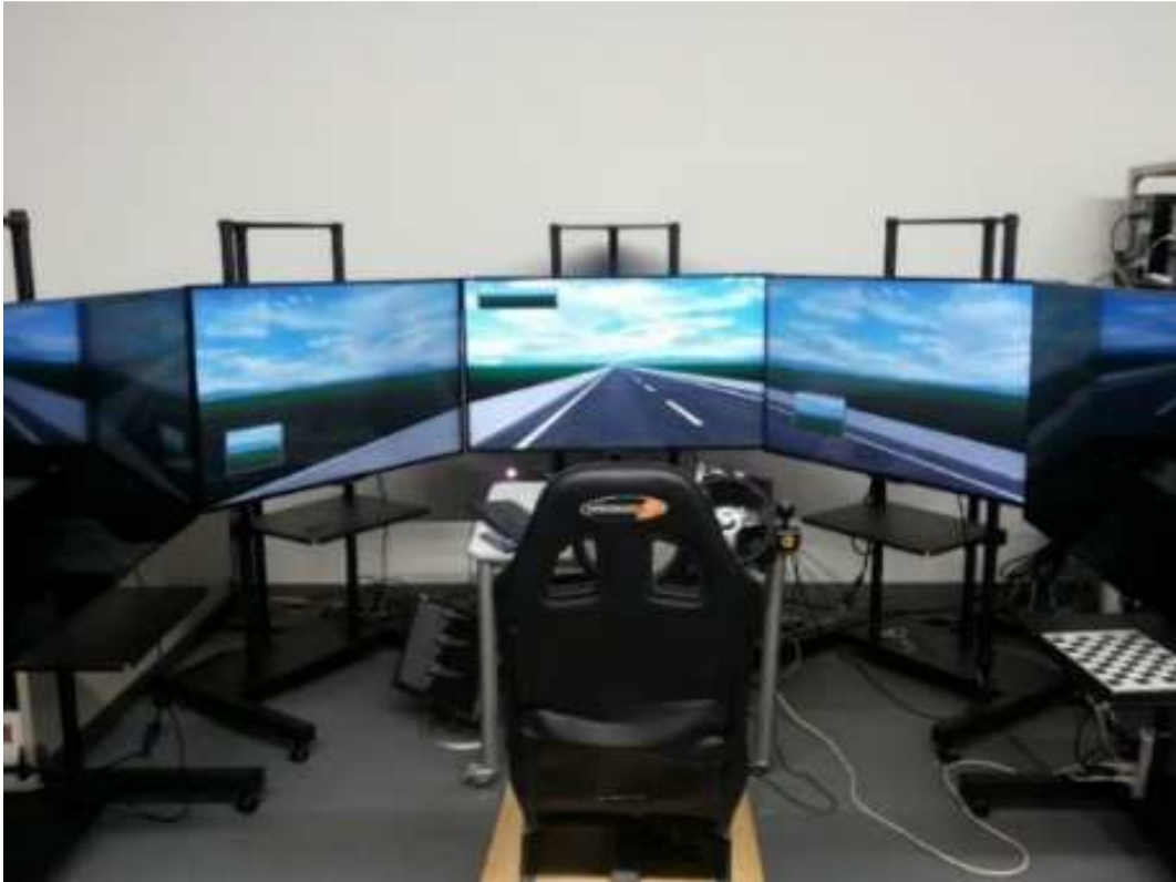
Fig. 1. The driving simulator used in the study.

The trials were conducted on a two-lane rural road (one for each direction of travel) with no divider; Lanes were 3.2 m wide and the shoulders were 0.4 m wide. The data collected during Route 2 were used for the models described in this paper. The road was about 16 km long and the trial included seven overtaking manoeuvres with oncoming traffic. The manoeuvres occurred on straight stretches of road with good visibility, in the presence of a dashed centre line. The order of the overtaking manoeuvres (which varied in terms of nominal TTC) was not randomised among the participants, thus ensuring that different participants experienced the same environmental conditions during each manoeuvre (e.g., the length of the straight stretch of road). The lack of randomization is not expected to be an issue, since the participants had already driven along the Trial route and Route 1; therefore, only marginal changes in participants' behaviours should have occurred. During the trial, the participants were requested to overtake cyclists as they would in real life and to keep the speed of the vehicle as close as possible to the speed limit of 70 km/h.